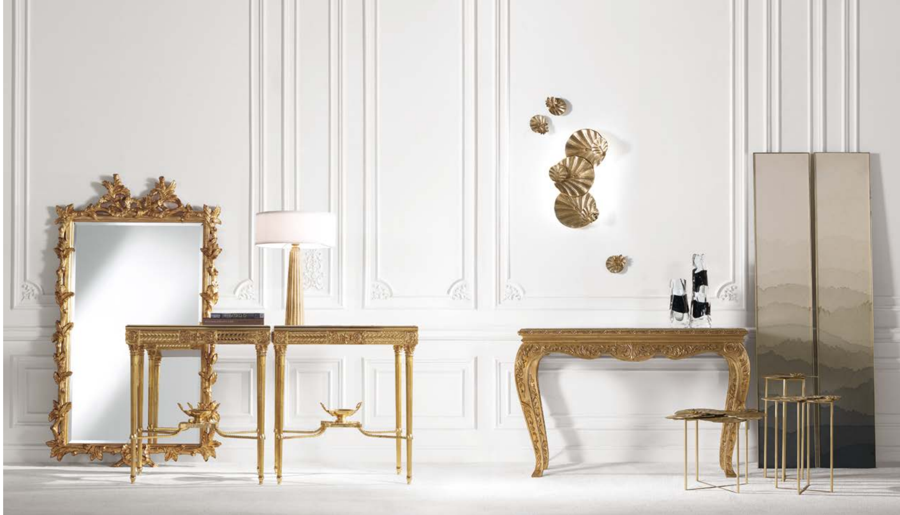
CHABLIS MIRROR SHOGUN CONSOLE AISA TABLE LAMP