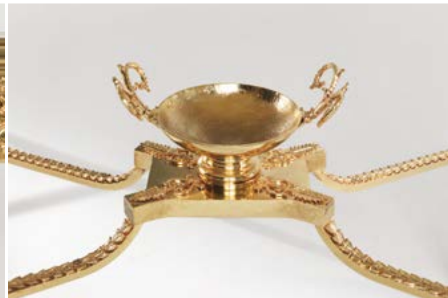
CHABLIS MIRROR SHOGUN SIDE TABLE