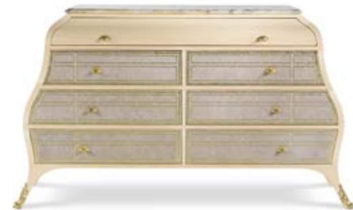
MADELEINE CHEST OF DRAWERS