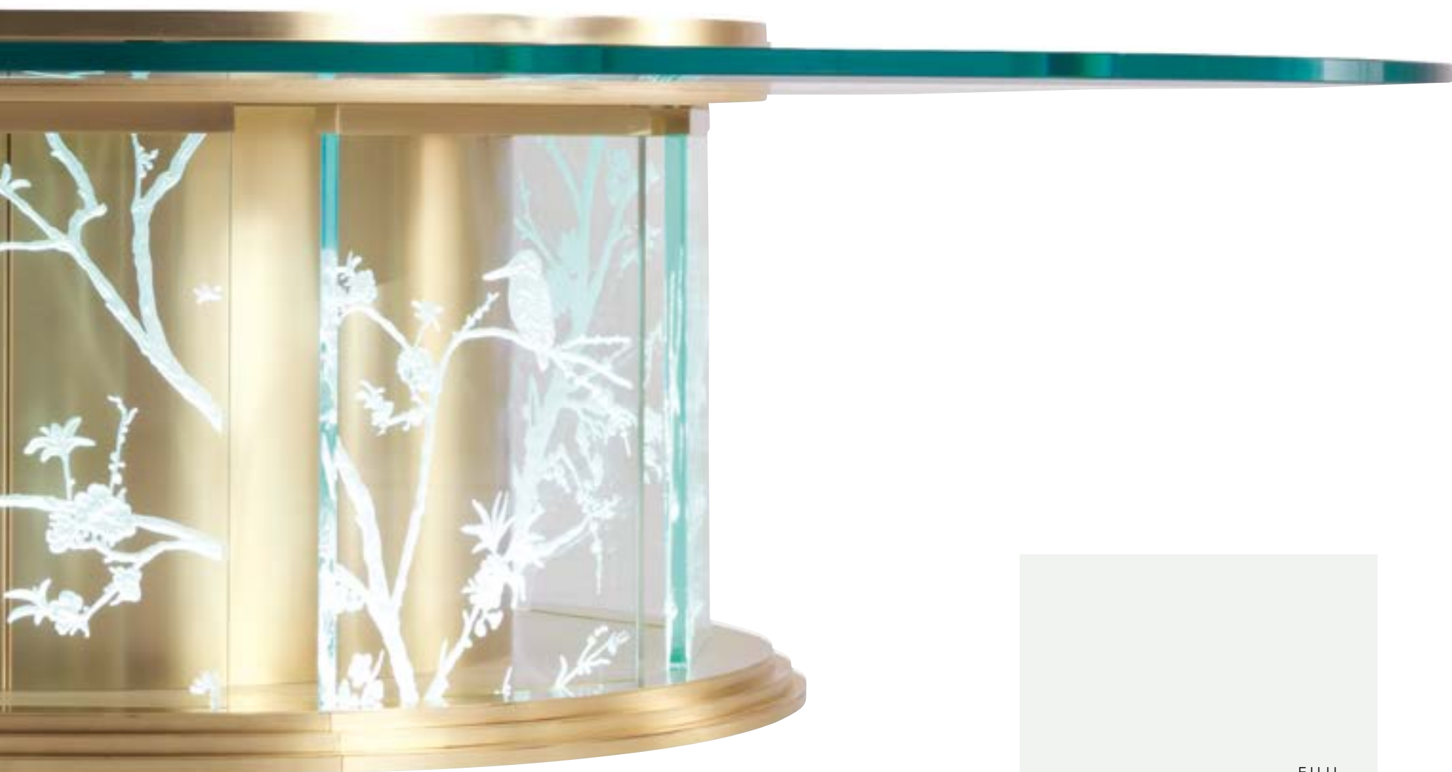
FUJI CENTRAL TABLE TOKYO MODULAR SOFA OSAKA CEILING LAMP