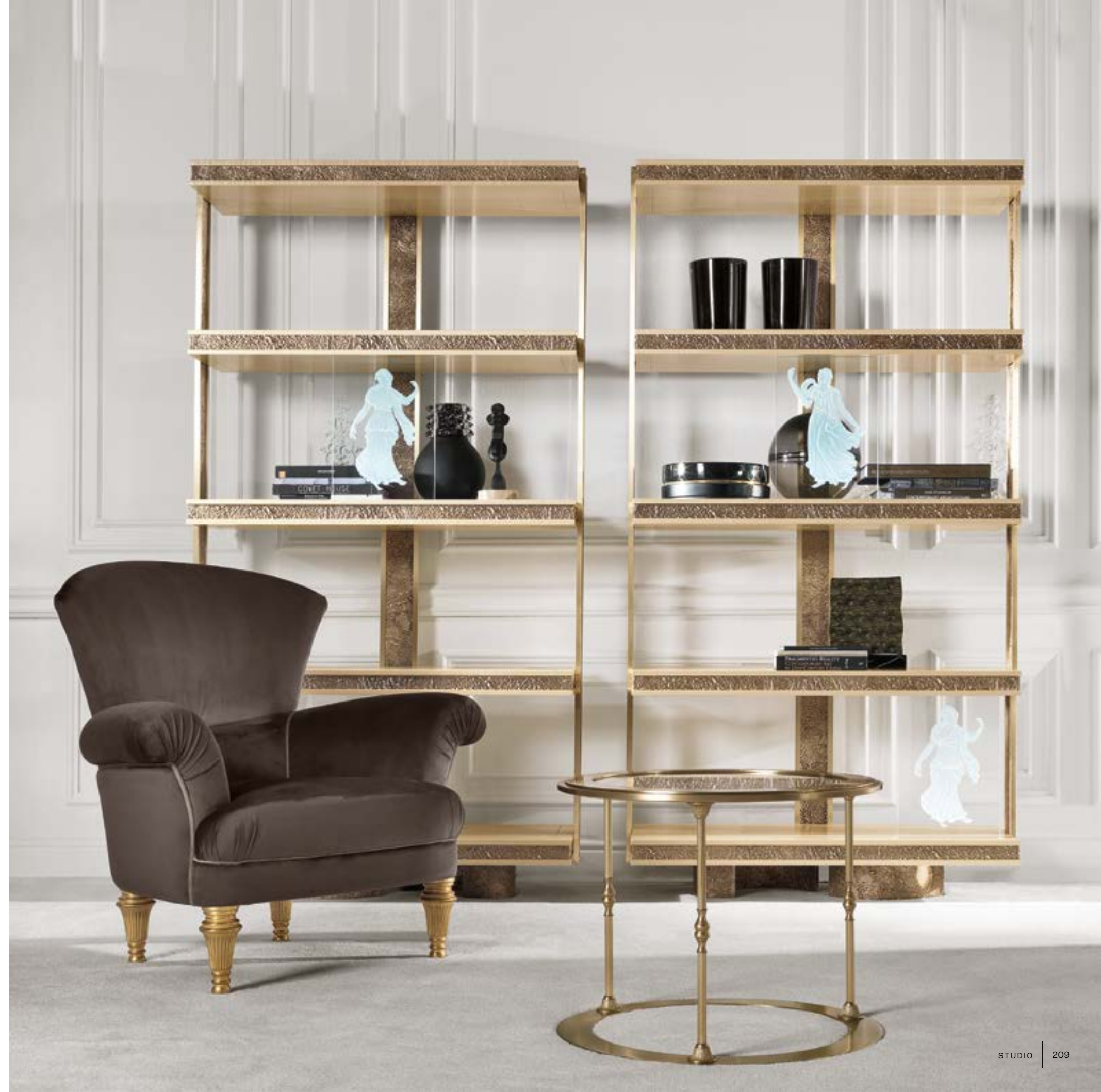
TOULOUSE SIDE TABLE