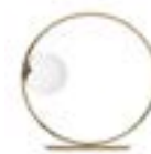
CHA-FUJ FUJI Wall lamp with structure in brass. Engraved glasses with decorations in Wedgwood style. 43 x 15 x h 54 cm