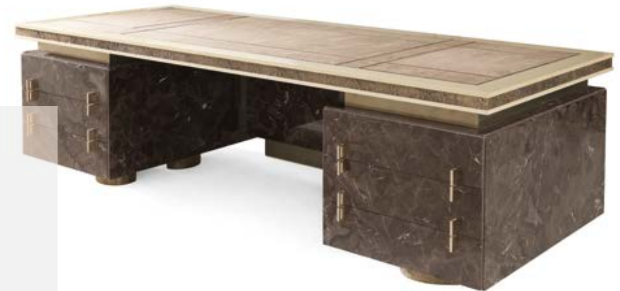
SHINTO WRITING DESK

Perfect centerpiece for executive and presidential offices, Shinto writing desk features a sculptural design and an exclusive composition, with a soft nubuck top, a structure in precious marble Brown Damasco and brass casting profiles.