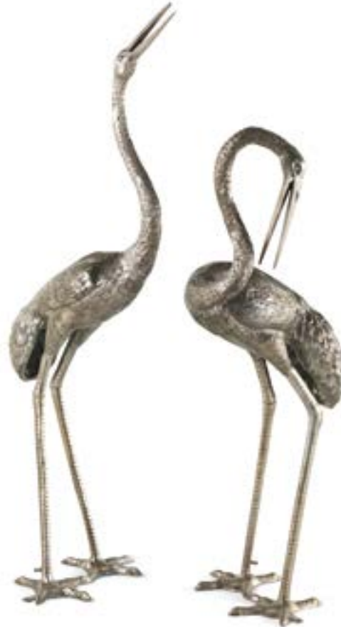
HERON SMALL BRONZE HERONS