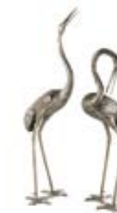
OBJ-256CA / OBJ-256CAA HERON Small decorative herons in bronze with silver finish. 50 x 25 x h 164 cm 50 x 25 x h 134 cm