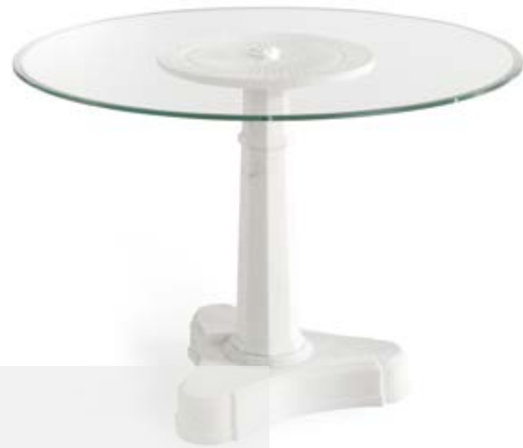
RELIEF SIDE TABLE

The superior quality of materials and the high level of craftsmanship, stand-out features of the entire collection, are perfectly embodied by the Relief table. This piece of furniture is made of Michelangelo statuary marble; an ancient and warm material, worked by hand with a special technique that allows classic 3D patterns to be created on tops and base units.