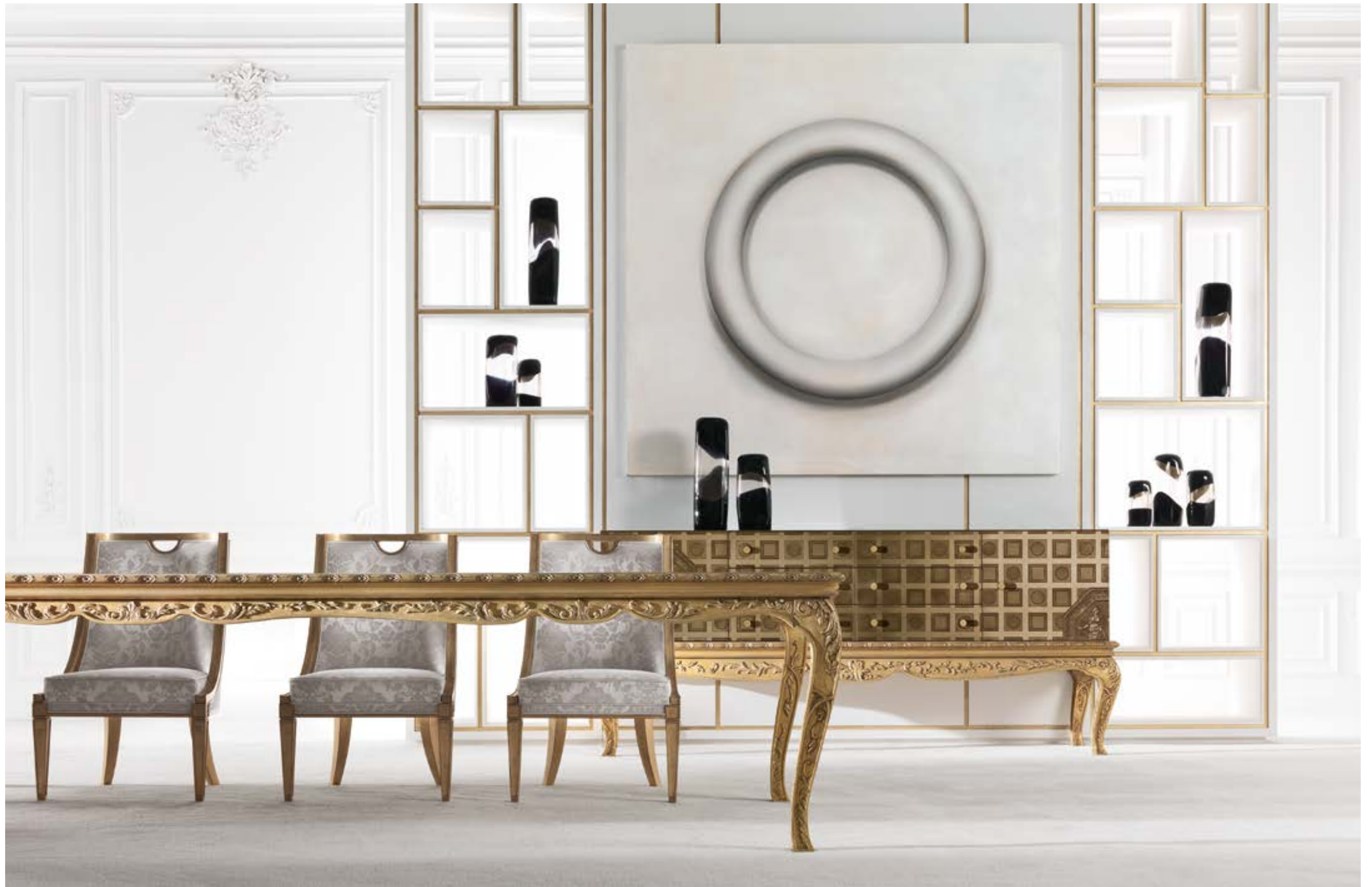
FRAGONARD DINING TABLE CHAIRS SIDEBOARD