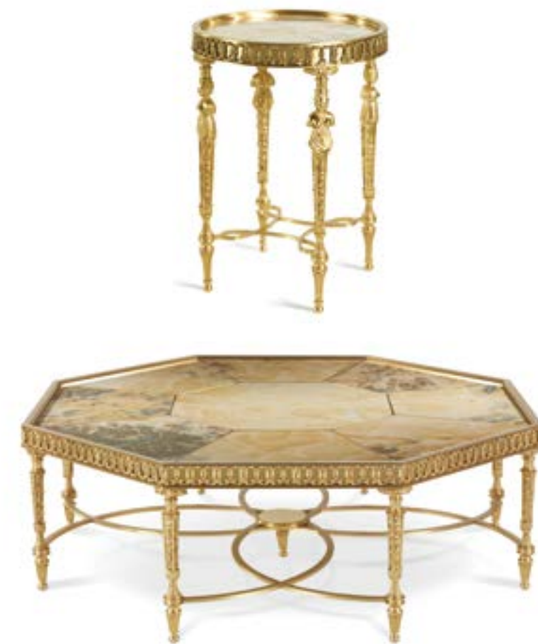
LUMIERE SIDE TABLE LUMIERE CENTRAL TABLE

An elaborate brass structure with eight skilfully chiselled legs and a play of curving lines that intersect creating a flower-shaped element with a central element in Cloudy onyx. That's the artistic base that holds the octagonal top in precious grey onyx. A Louis XVI style piece of furniture creatively revisited in a brighter, contemporary version.