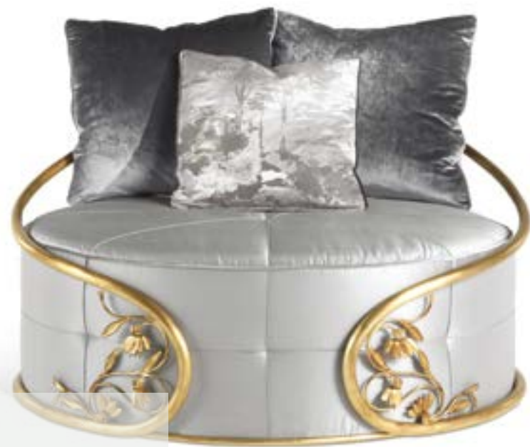
YOSHI PADDED ARMCHAIR

Yoshi is a pouf-shaped armchair with soft and sinuous lines, recalling the figure of the circle, a symbol that, in the Zen tradition, expresses the opposition between two complementary forces that flow eternally towards each other. The metal structure with gold leaf finish is enriched by decorative elements inspired by the natural world, such as flowers and leaves.