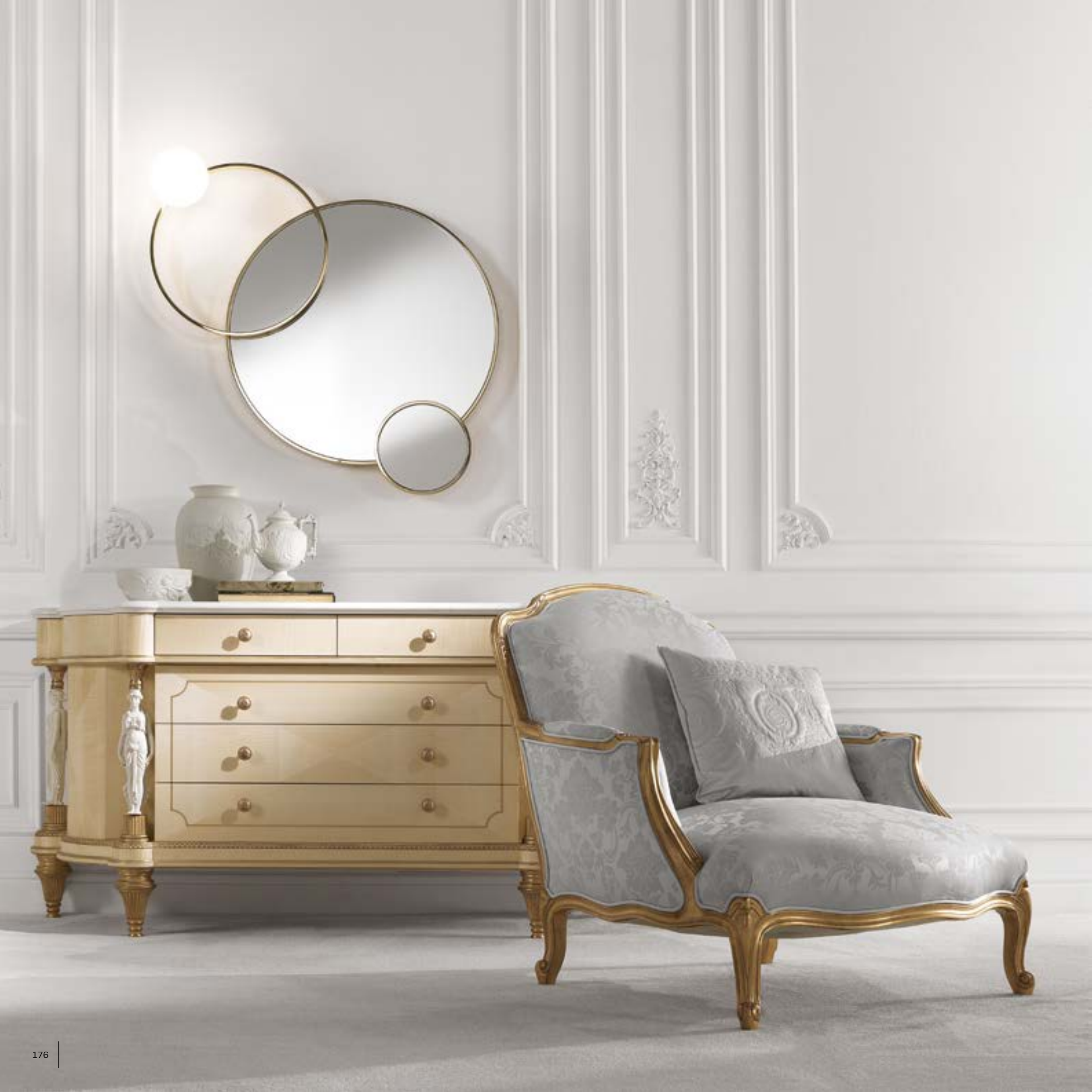
TOULOUSE CHEST OF DRAWERS BIENVENUE ARMCHAIR SPIRITOS MIRROR