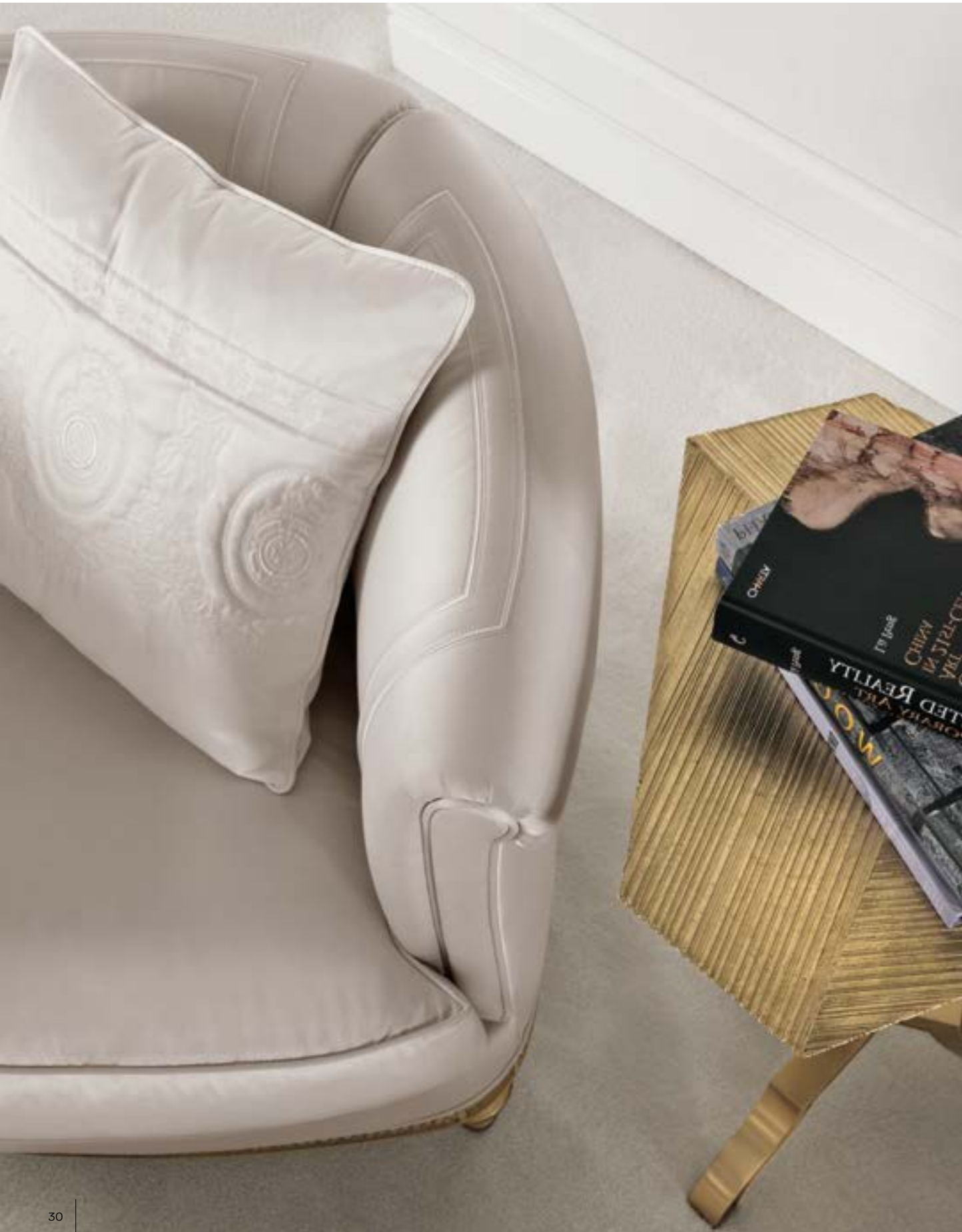
IVY ARMCHAIR TIARA SIDE TABLE