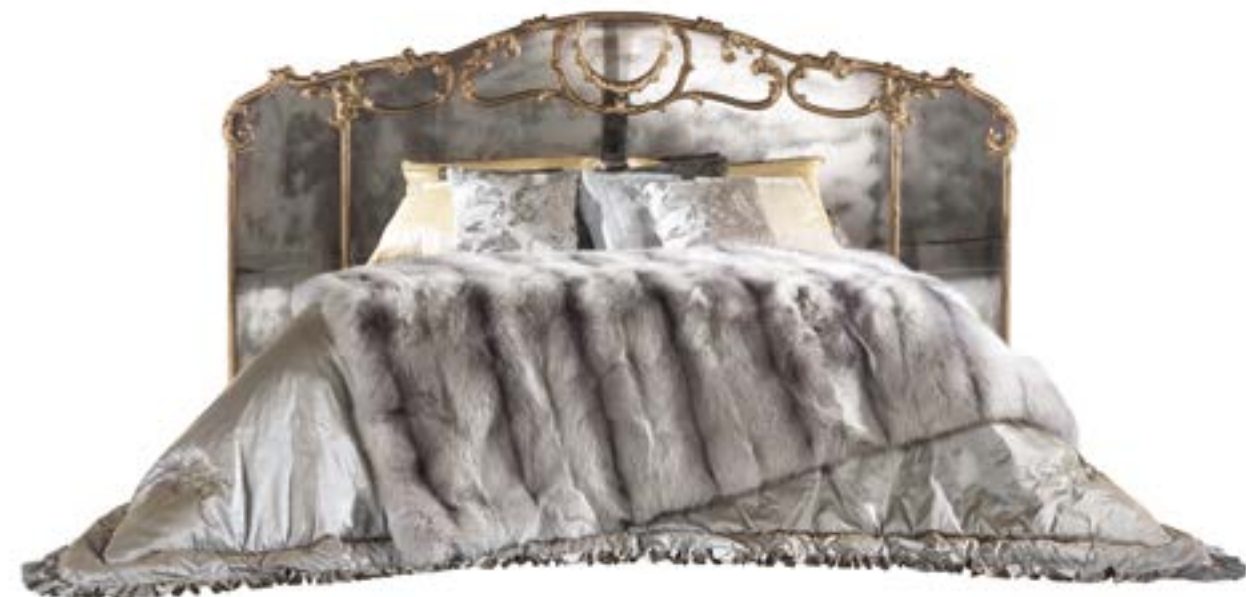
MADELEINE BED IN BRASS WITH EXTRALARGE HEADBOARD COVERED IN SILVER PLATE