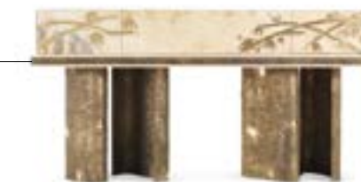
SHI-21 SHINTO Console with structure in wood covered with Cloudy onyx with gold leaf decorations. Sculptural bases in casted brass with antique bronze finishing. 198 x 48 x h 99 cm