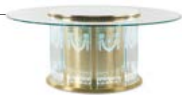
FUJ-114R FUJI Dining table with structure in brass and engraved glasses with Greek classical decorations. Top in bevelled glass with rotating lazy susan in lightened white marble. Lighting system. ø 250 x h 82 cm ø 200 x h 82 cm