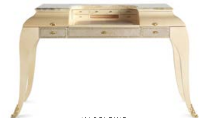
MADELEINE DRESSING TABLE