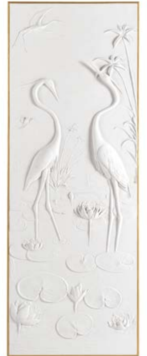
FRAGONARD DECORATIVE PANELS