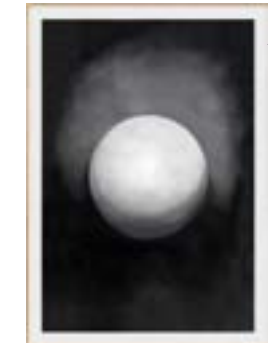
PAI-SPHERE SPHERE Oil painting with frame. 142 x h 201 cm