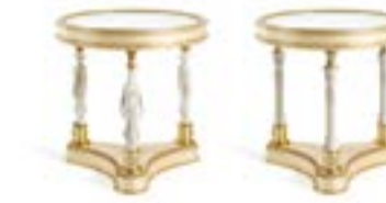
TOU-47B / TOU-147 TOULOUSE

Side tables with structure in multilayer maple wood. Top in white marble. Profile and details in antique gold with patina JG294. Bisquit porcelain statues. Also available with neoclassical columns (TOU-147). Lost-wax casted brass details. ø 66 x h 66,5 cm