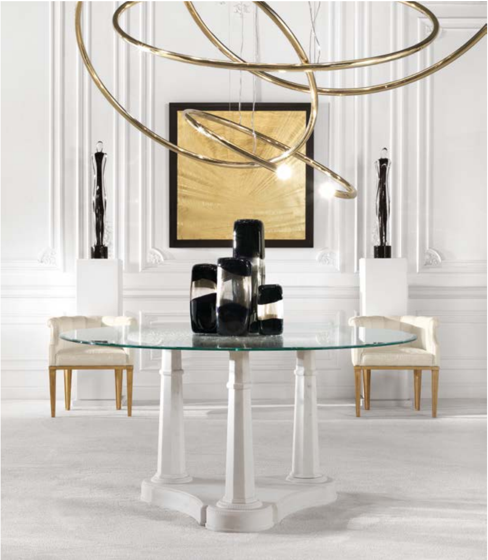
RELIEF ENTRANCE TABLE GOLDDRAY PAINTING FUJI CHAIRS OSAKA CEILING LAMP