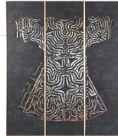
PAI-KIM KIMONO Decorative panels. 80,5 x h 280,5 cm (each)