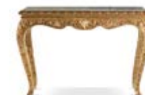
FRA-21 FRAGONARD Baroque style console with structure in beech wood. Low relief carvings finished in gold with patina J2910. Top in Cloudy onyx. 133 x 51 x h 90 cm