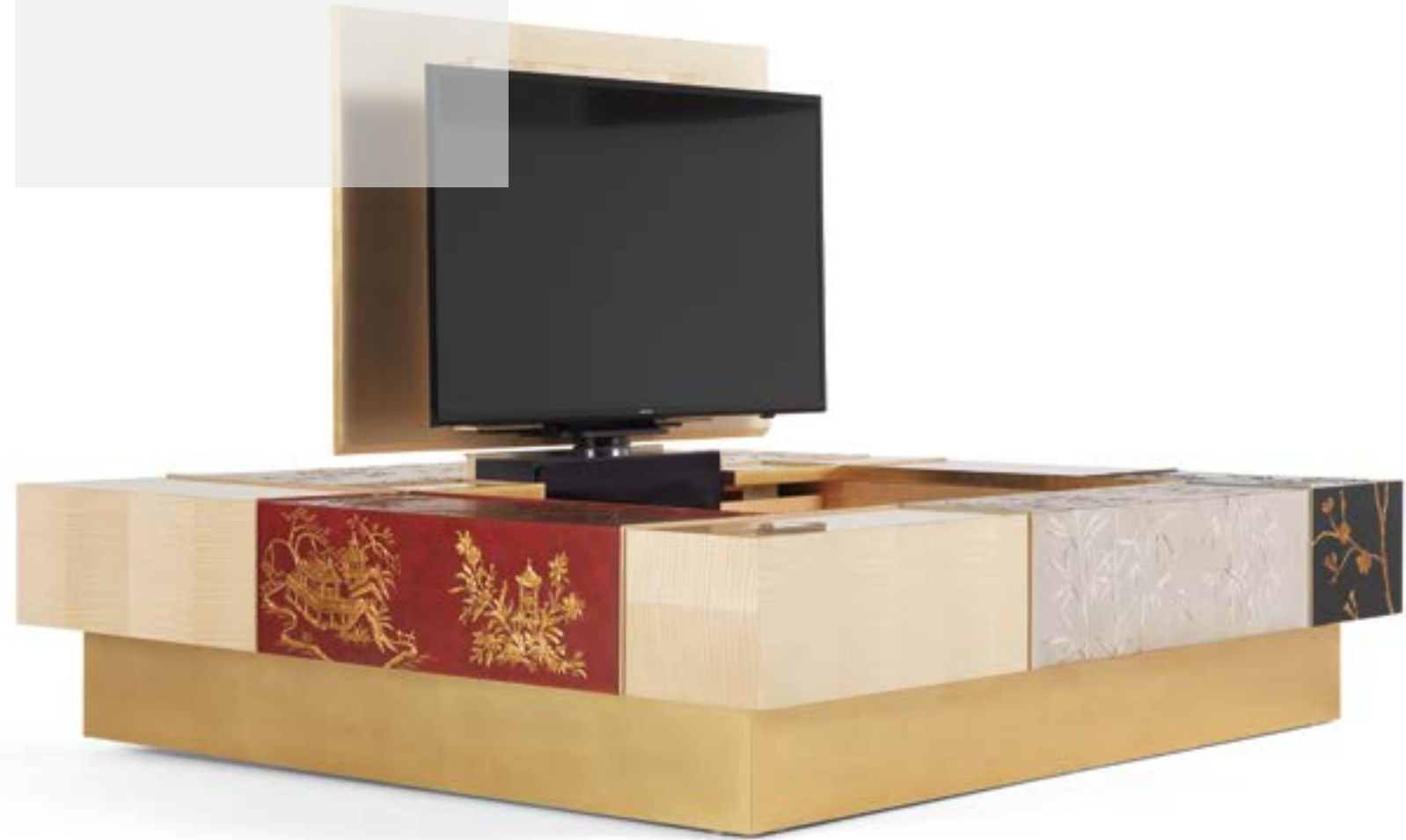
UKIYO CENTRAL TABLE

"Ukiyo": an evocative name recalling the "images from the floating world" of Japanese tradition. The central table of the line is characterized by a composition that alternates elements veneered in frisé maple with tiles decorated using gypsum as a support, in relief or engraved, and subsequent chromatic decoration, as in the famous traditional Chinese lacquers. The special automatism allows to extract a retractable rotating television.