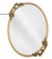
MAL-04 MADELEINE Mirror with structure in casted brass. Natural mirror. 60 x h 83 cm