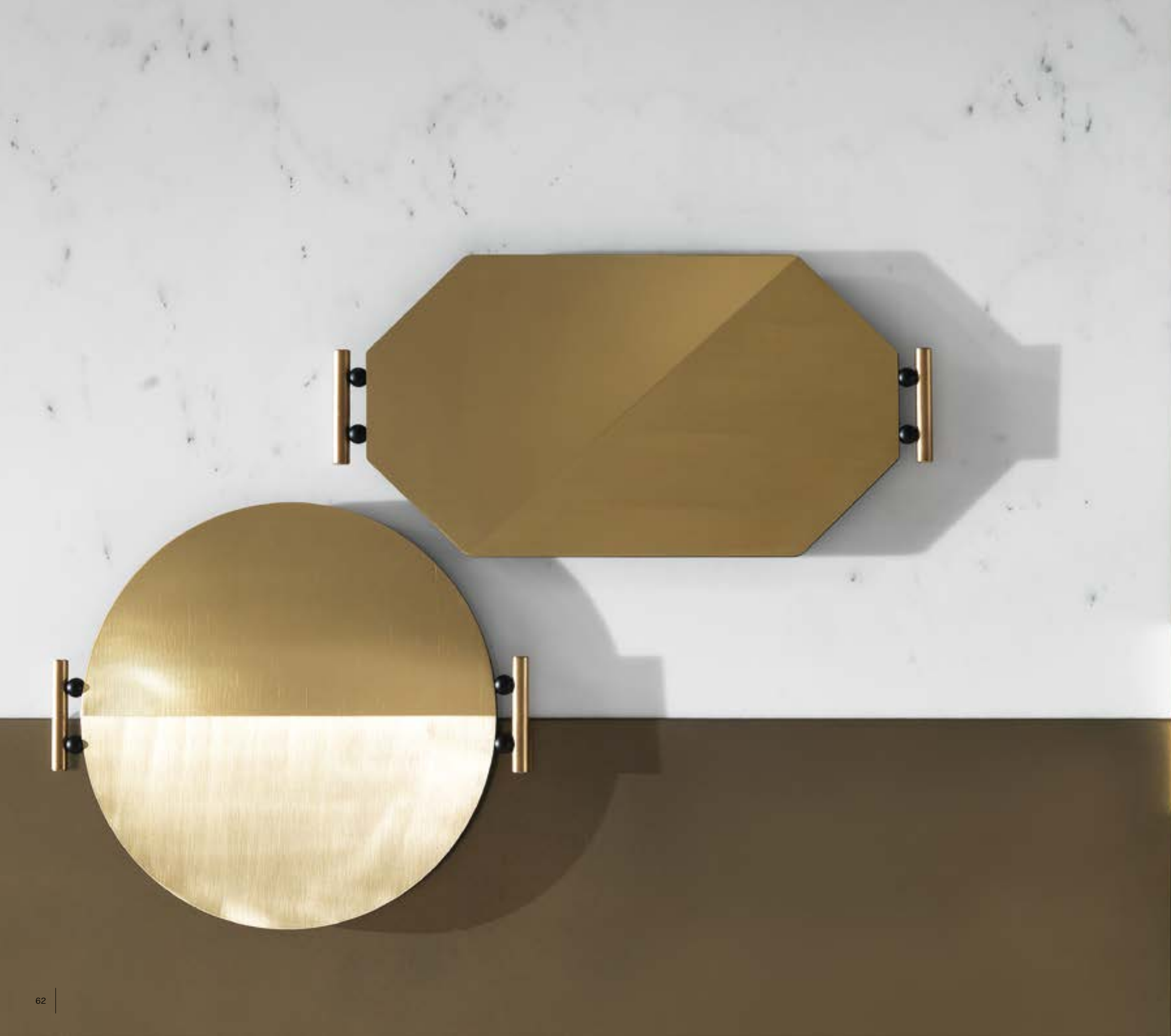
SHINTO CENTRAL TABLE