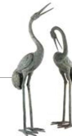
OBJ-256BA / OBJ-256BAA HERON Big decorative herons in bronze with natural finish. 60 x 40 x h 260 cm 60 x 40 x h 220 cm