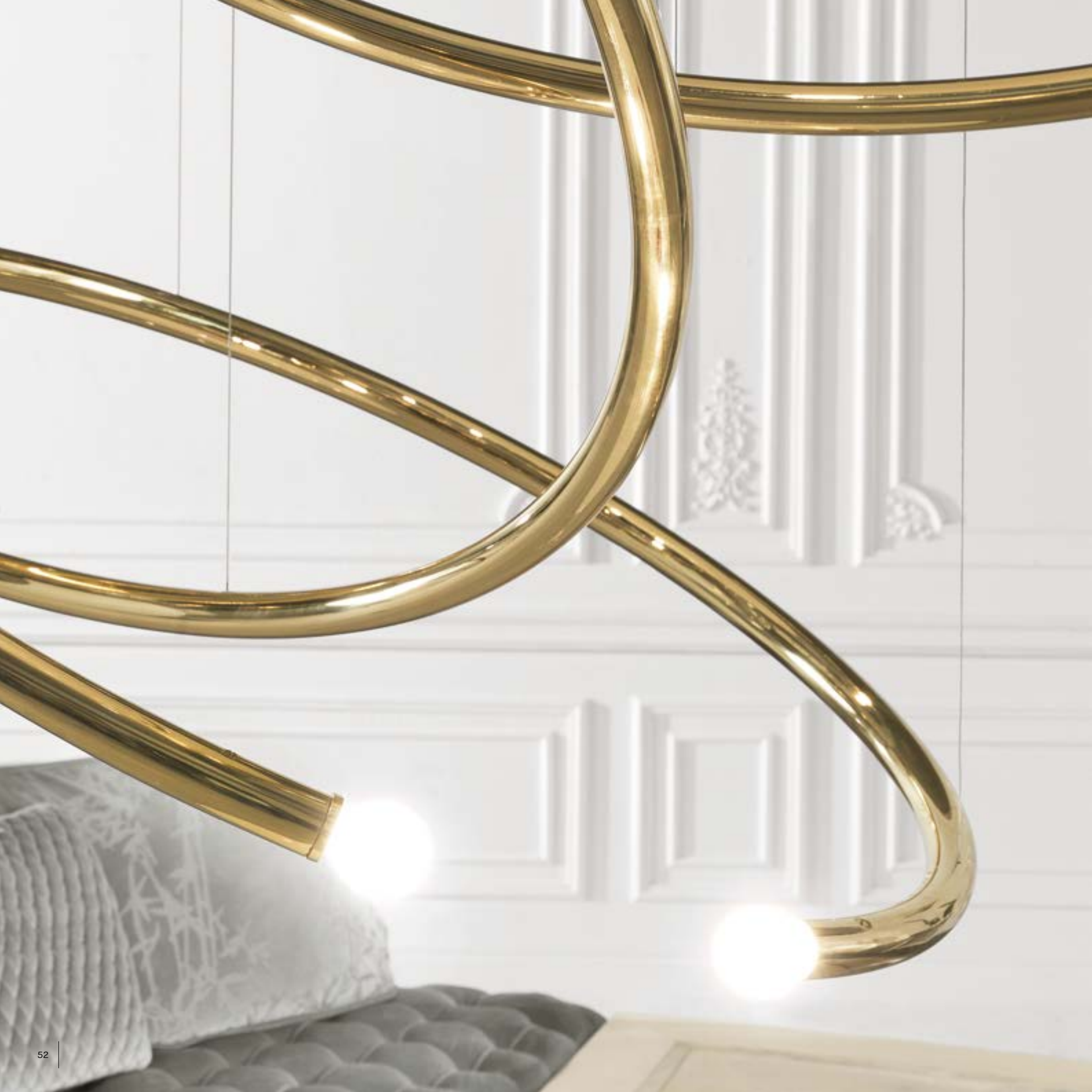
TOKYO MODULAR SOFA HIROKO POUF SIDE TABLE OSAKA CEILING LAMP