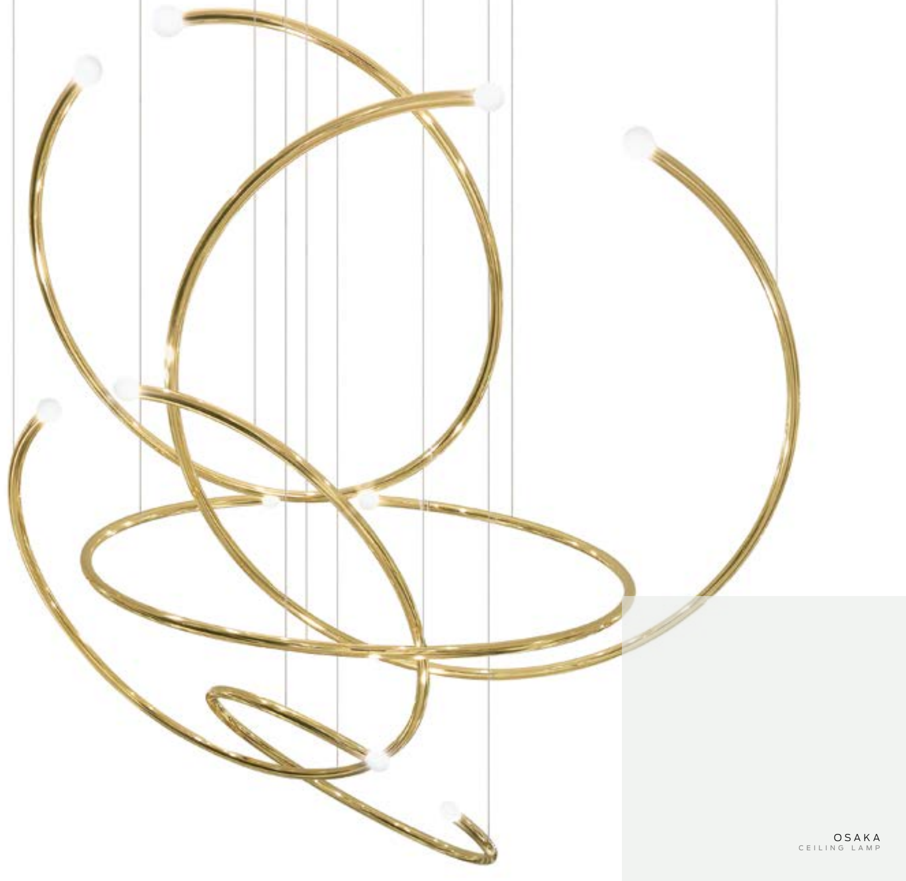
OSAKA CEILING LAMP

A refined harmony of lines, lights and colors. Spiritos table lamp, with its original shape inspired by the Fifties, combines with the precious decorative elements of the furniture to express an intimate and sophisticated approach to classic style.