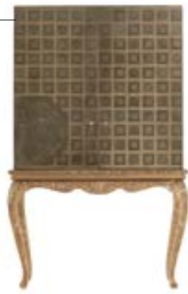
FRA-13 / FRA-33 FRAGONARD Cabinet/bar unit with structure in beech solid wood. Base in hand-carved beech wood, finished in antique gold with patina JG295. Upper part with Renaissance decorative elements made through liquid metal. 132 x 50 x h 208 cm