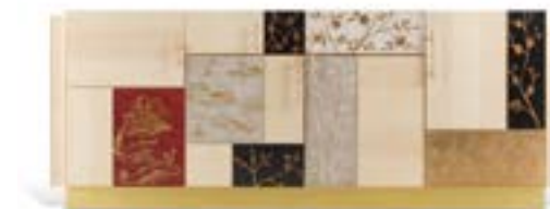
SHI-18 SHINTO TV holder with structure in wood covered with Cloudy onyx and with gold leaf decorations. Sculptural bases in lost-wax casted brass, antique bronze finishing. 187 x 48 x h 71 cm