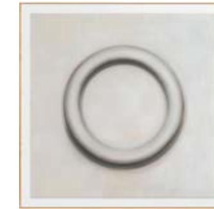
PAI-RING RING Oil painting with frame. 250 x h 250 cm