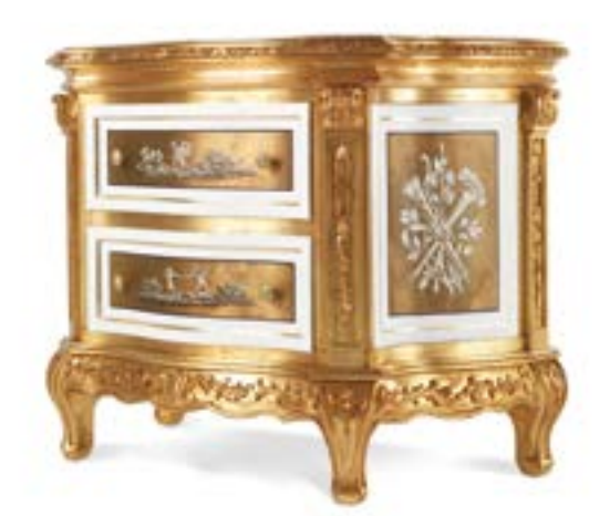
FRAGONARD NIGHT TABLE