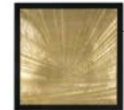
PAI-GOLDRAY GOLDRAY Oil painting, decoration in golden leaf. 103 x h 103 cm