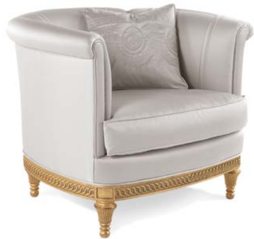
IVY ARMCHAIR PORTLAND CONSOLE RENAISSANCE MIRROR SPIRITOS TABLE LAMP