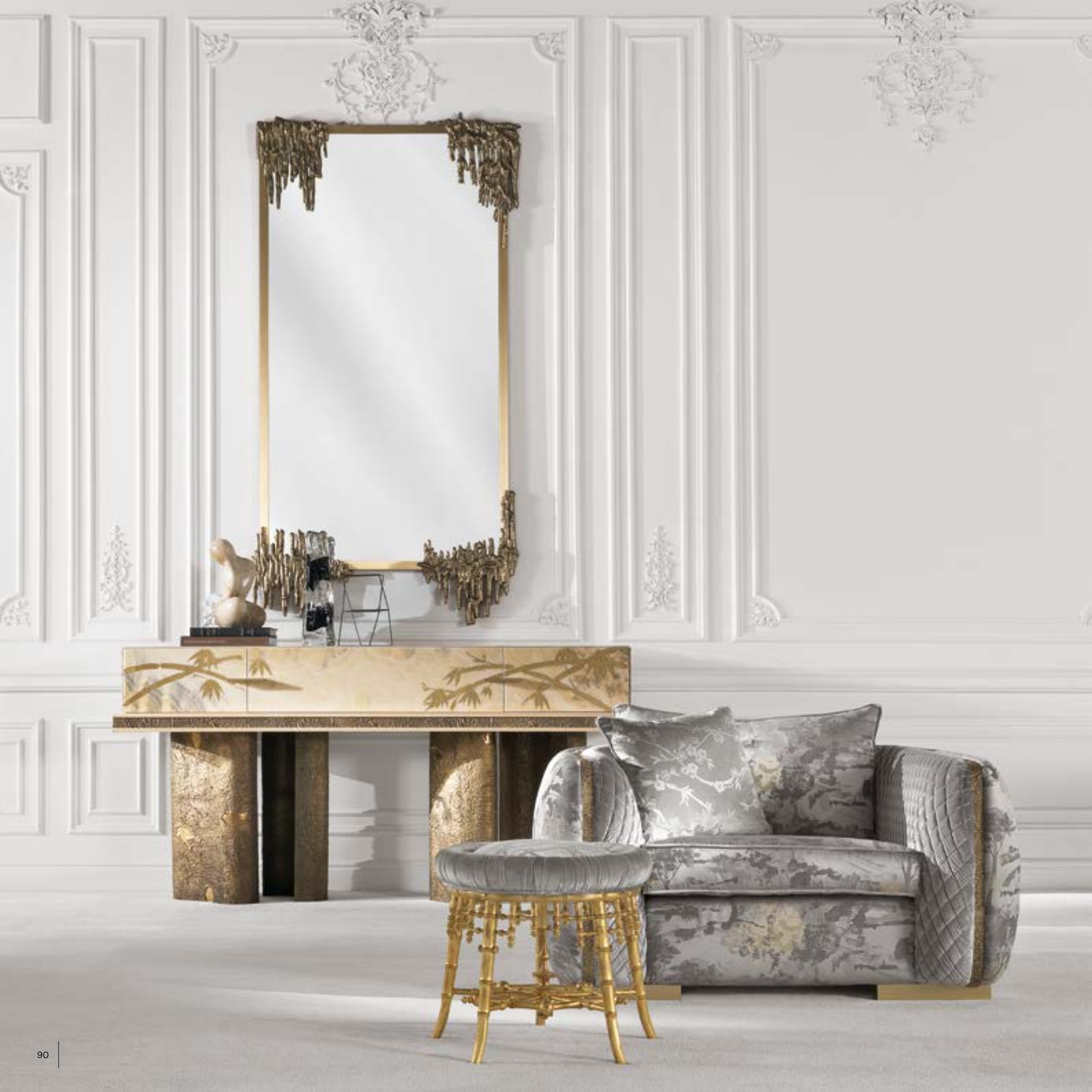
ARKÈ ARMCHAIR SHINTO CONSOLE IZUMI MIRROR HIROKO STOOL