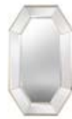
OCT-04B OCTOGONE Mirror with structure in metal and bevelled mirrors. 70,5 h 120,5 cm