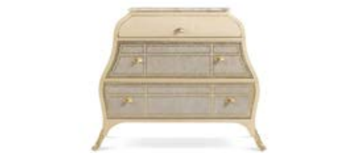
MADELEINE NIGHT TABLE