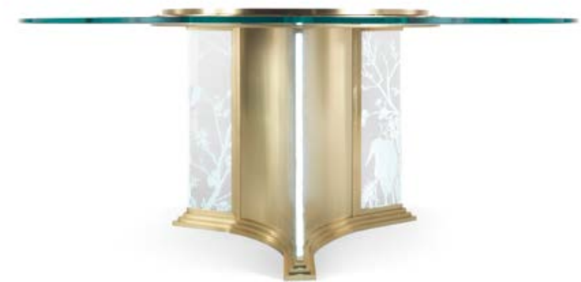
FUJII DINING TABLE