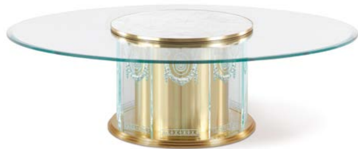
FUJI DINING TABLE