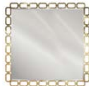
ETO-12B ETOILE Mirror with structure in brass. Bevelled mirror. 155,5 x h 155,5 cm