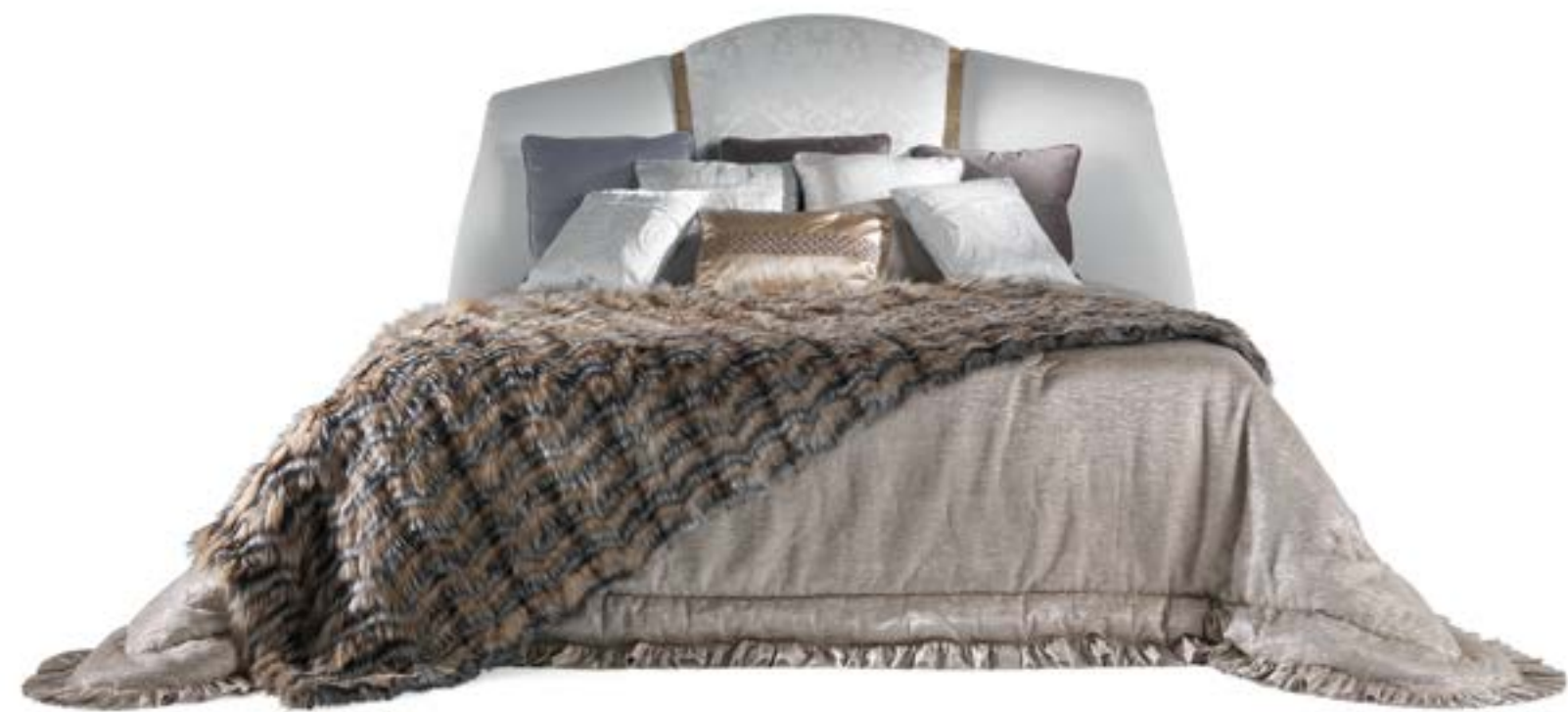
TROISPLACES UPHOLSTERED BED WITH DETAILS IN CASTED BRASS