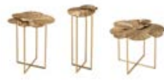
MON-47A / MON-47B / MON-47C MONET

Side tables in hand-chiseled casted brass. ø 44 x h 54 cm ø 34 x h 64 cm ø 56 x h 45 cm