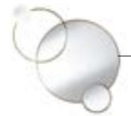
SPI-04B SPIRITOS Mirror with structure in brass and bevelled mirrors. Lighted sphere lamp. 97 x 24 x h 102 cm