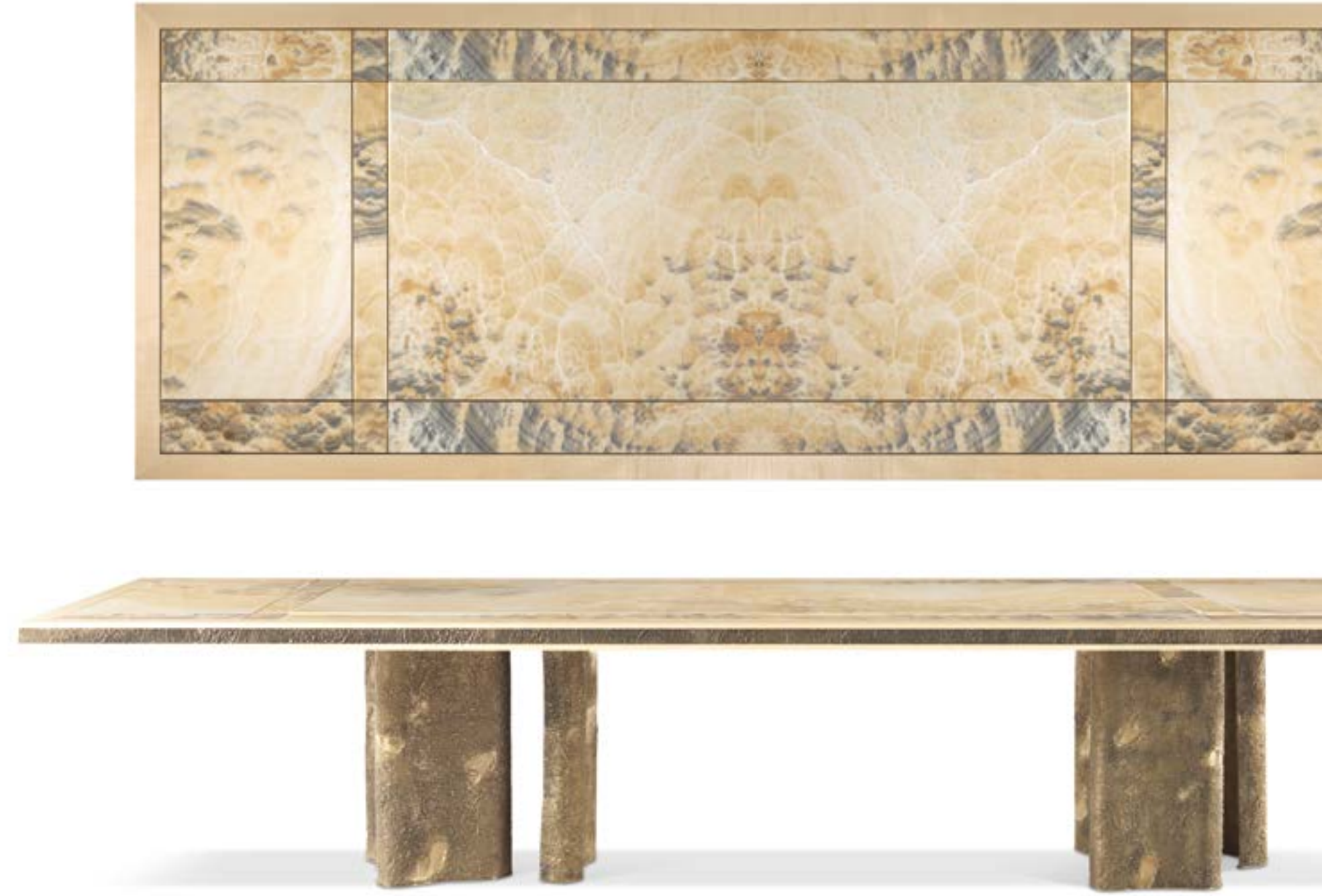
SHINTO DINING TABLE