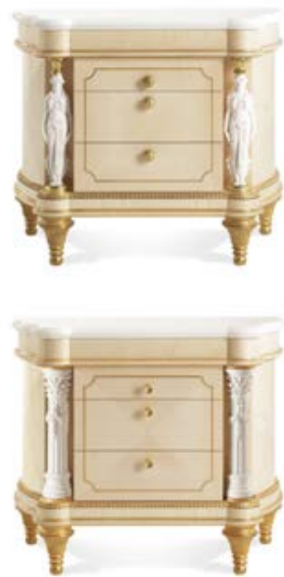
TOULOUSE NIGHT TABLES