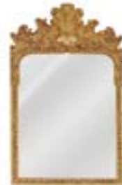
FRA-04B FRAGONARD Mirror with structure in hand-carved beech wood finished in gold with patina J2910. Natural mirror. 90 x h 145 cm