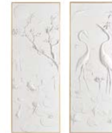
FRA-123A / FRA-123B FRAGONARD Gypsum decorative panels. 90 x h 250 cm (each)