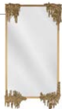
IZU-12 IZUMI Mirror with structure in lost-wax casted brass. Natural mirror. 107 x h 207 cm