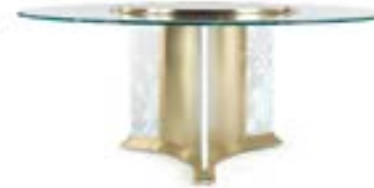
FUJ-14R-A FUJI Dining table with structure in brass and engraved glasses with Oriental classical decorations. Top in bevelled glass with rotating lazy susan in cloudy onyx. Lighting system. ø 200 x h 79 cm