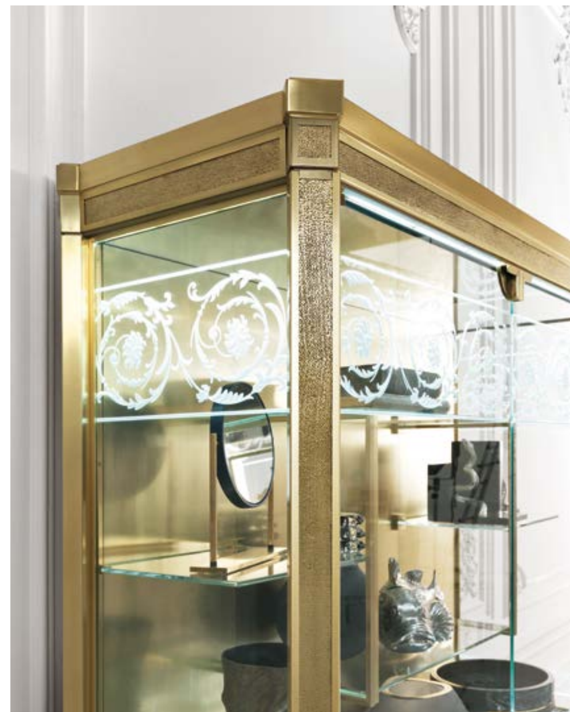
FUJI SHOWCASE CHAIR