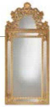
REN-12 RENAISSANCE Mirror with structure in hand-carved lime solid wood finished in antique gold with patina J2880. Natural mirror. 81,5 x h 192 cm