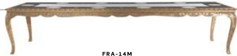
FRA-14M FRAGONARD Dining table with structure in hand-carved beech wood finished in antique gold with patina JG295. Top with Renaissance decorative elements made through liquid metal. Lightened white marble. 400 x 146 x h 81 cm