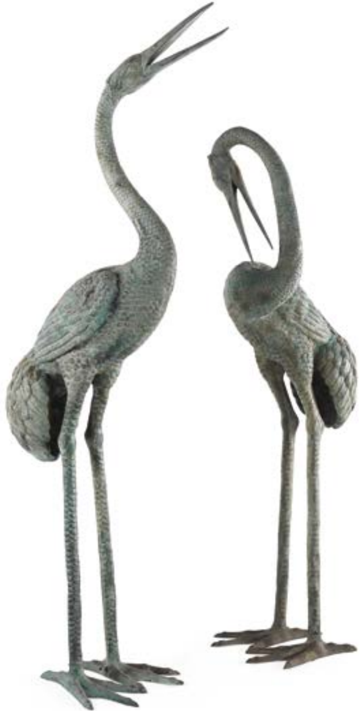
HERON BIG BRONZE HERONS

Nature as a vision and a primary inspiration. The Heron, a regal bird full of wisdom, is transformed in a bronze sculpture: a scenographic element symbolizing stillness and tranquillity, but also determination and opportunity.