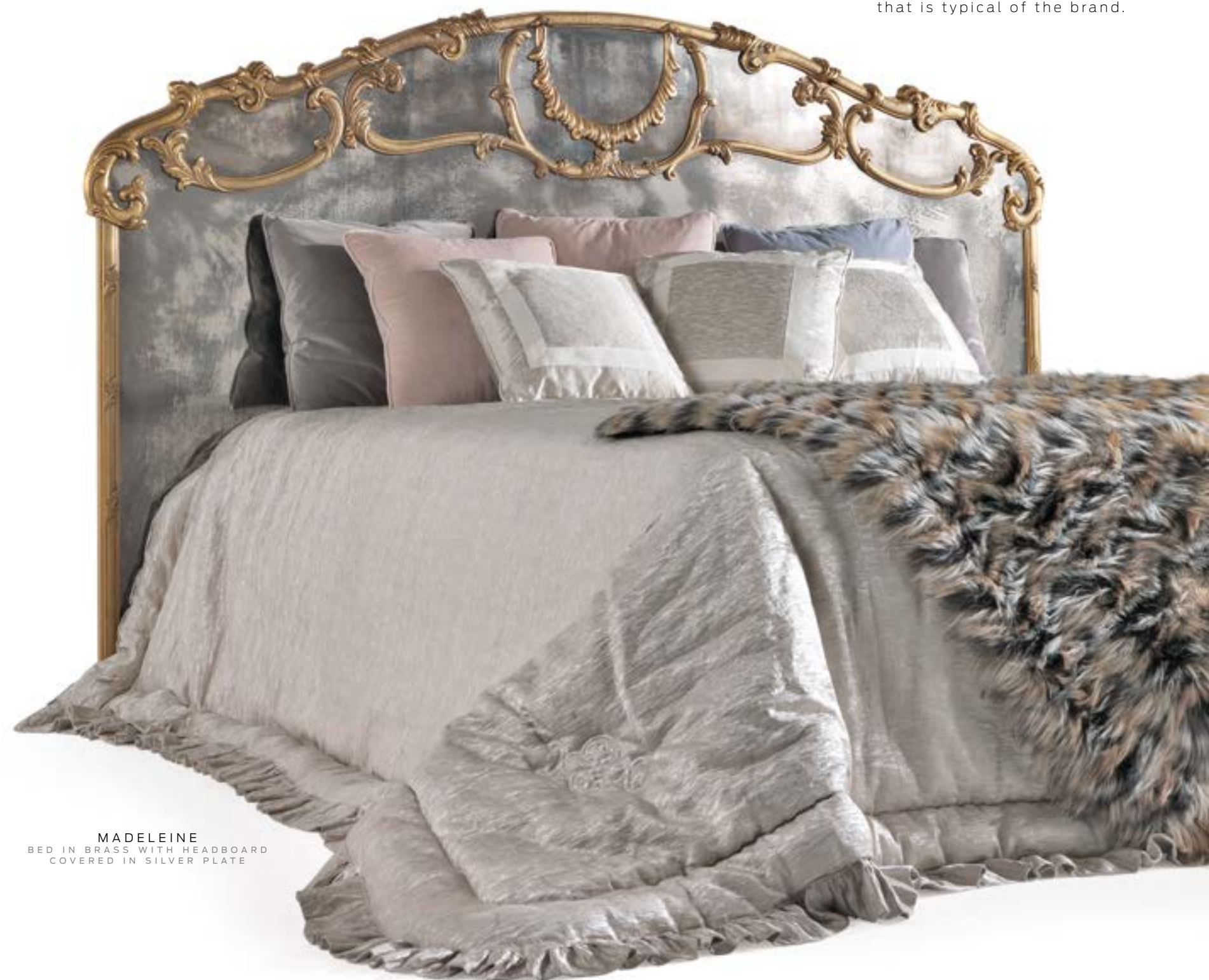
MADELEINE BED IN BRASS WITH HEADBOARD COVERED IN SILVER PLATE