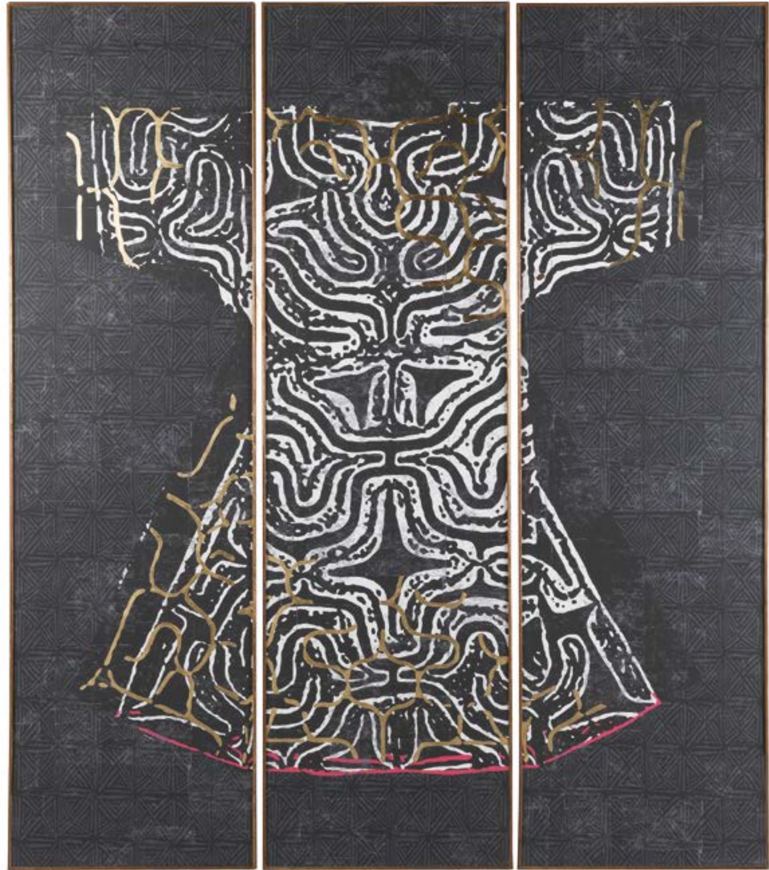
KIMONO DECORATIVE PANELS