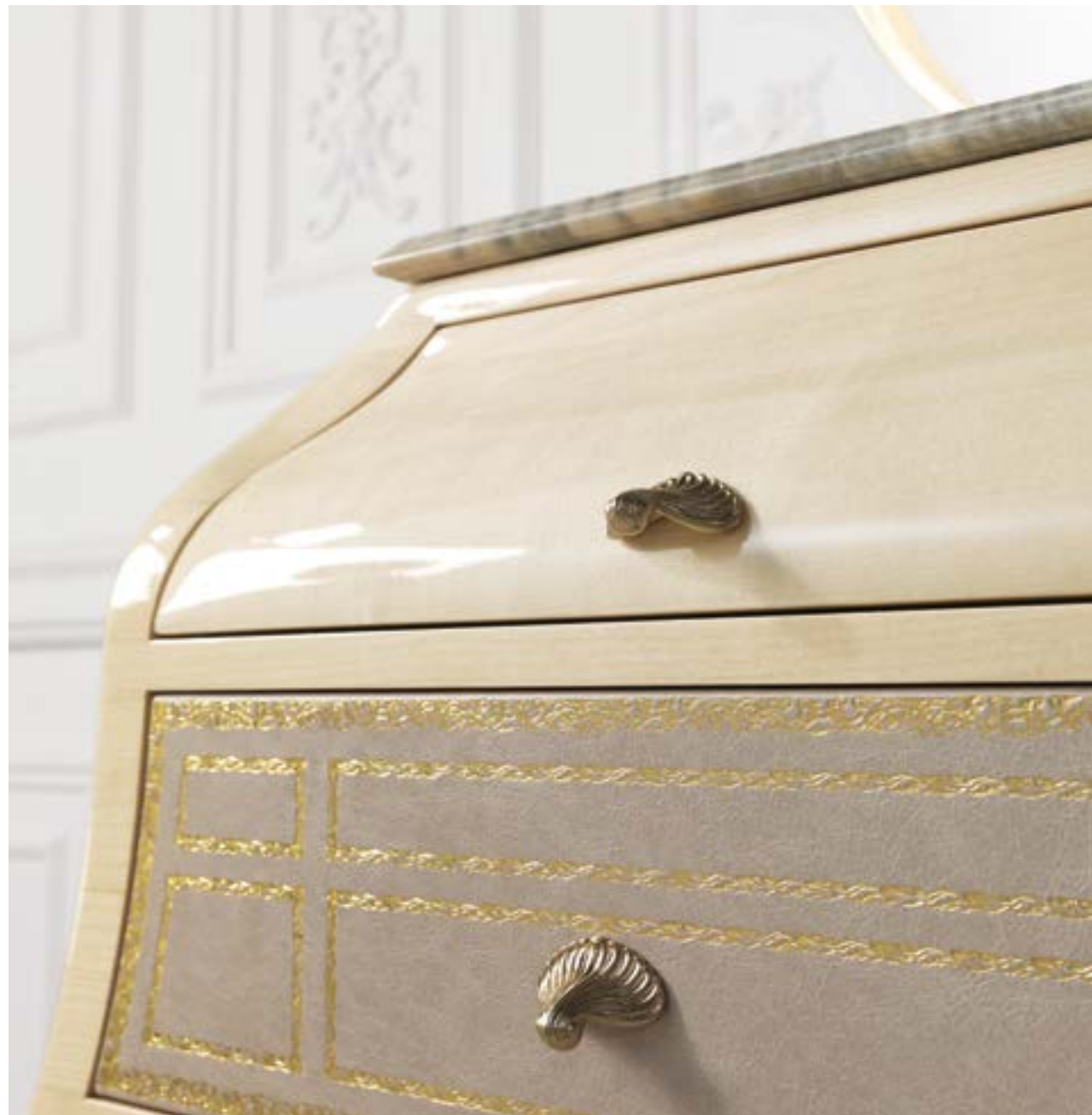
MADELEINE MIRROR CHEST OF DRAWERS SIDE TABLE DIVA ARMCHAIR SPIRITOS TABLE LAMPS