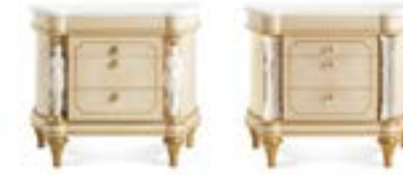
TOU-05M / TOU-105M TOULOUSE

Night tables with structure in curved multilayer maple wood. Top in lightened white marble. Brass profiles. Details in antique gold with patina JG294. Bisquit porcelain statues. Also available with neoclassical columns (TOU-105M).