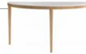
AND-21 ANDROMEDA Console with structure in brass. Top in lightened white marble. 151 x 46 x h 82 cm