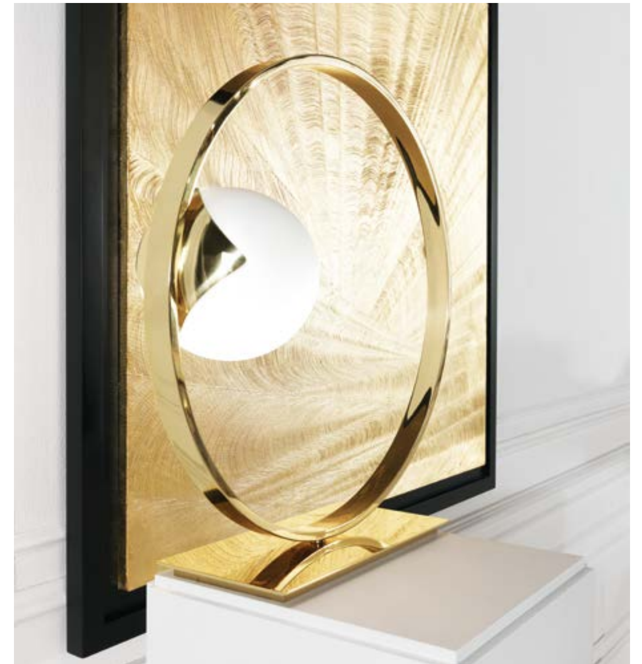
SPIRITOS TABLE LAMP GOLDRAY PAINTING

A refined harmony of lines, lights and colors. Spiritos table lamp, with its original shape inspired by the Fifties, combines with the precious decorative elements of the furniture to express an intimate and sophisticated approach to classic style.