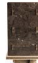
SHI-24 SHINTO Tall chest of 6 drawers with structure in wood covered with Brown Damasco marble. Sculptural base in casted brass with antique bronze finishing. 71 x 50 x h 113 cm