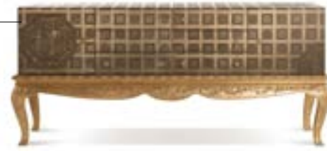
FRA-11 FRAGONARD Sideboard with structure in beech solid wood. Base in hand-carved beech wood, finished in antique gold with patina JG295. Upper part with Renaissance decorative elements made through liquid metal. 227 x 59 x h 100 cm