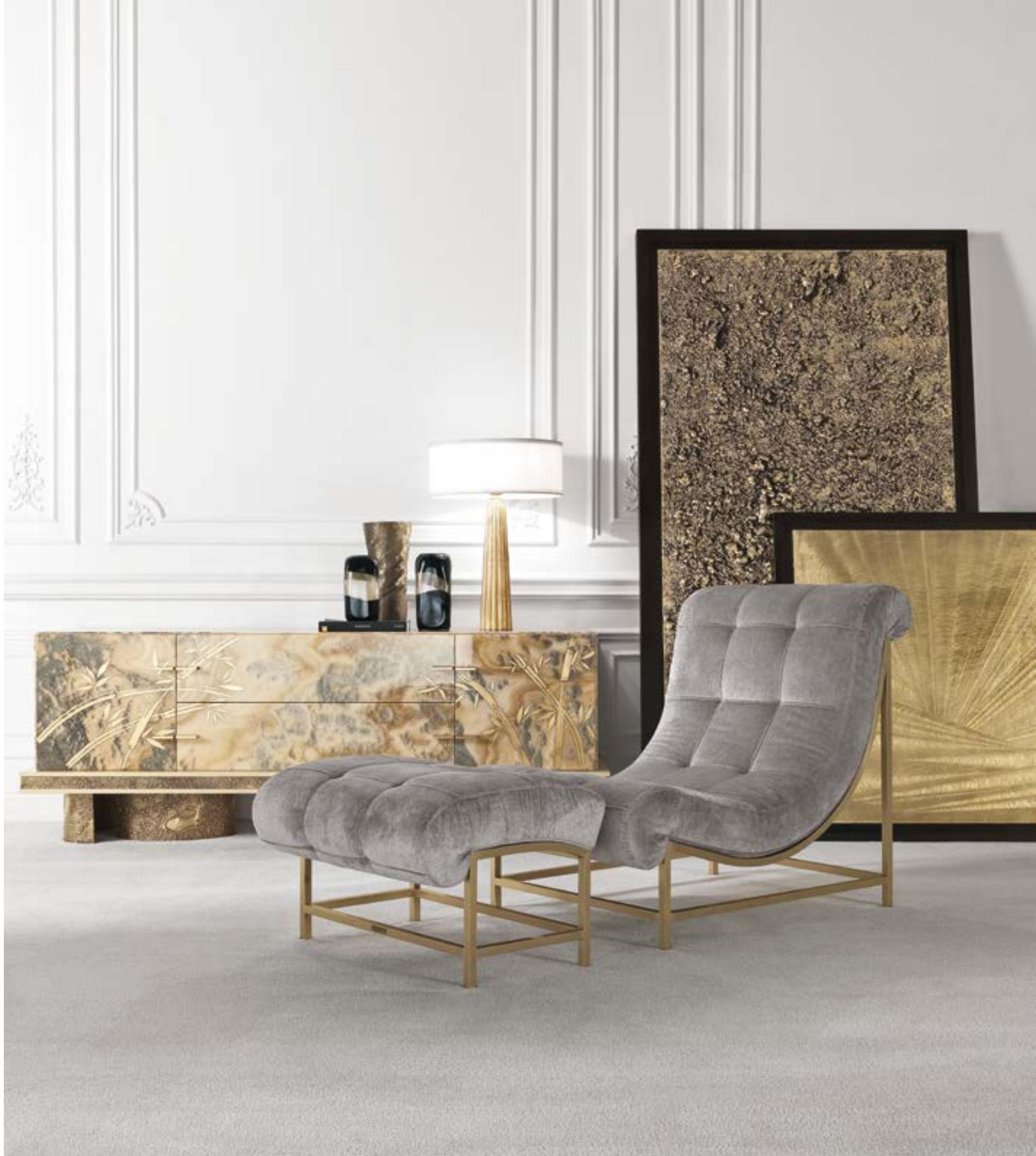
MARQUISE ARMCHAIR FOOT-REST SHINTO TV HOLDER

Comfort, pleasure and elegance for the Marquise armchair. Its sinuous and sensual shape recalls the round and curved lines typical of the Baroque art: an harmonious contrast with the sculptural shapes of the Shinto tv unit, distinguished by an original combination of materials, including natural maple, precious onyx and brass casting.