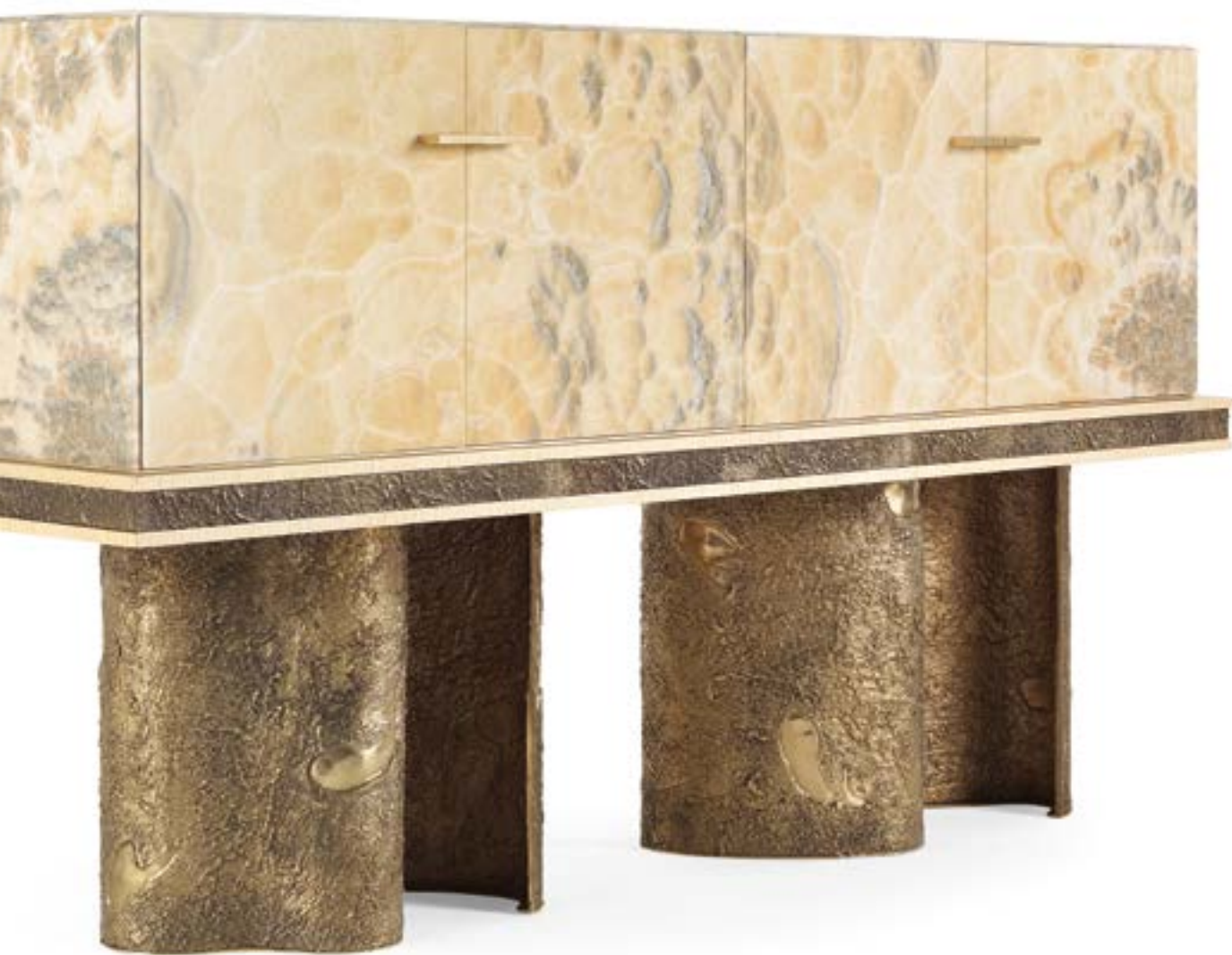
SHINTO SIDEBOARD DECÒ MIRROR TROIPLACES SOFA