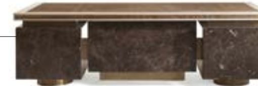
SHI-31 SHINTO Writing desk with structure in wood covered with Brown Damasco marble. Top in natural maple wood and Brown Nabuk. Details in liquid metal finishing. Sculptural bases in casted brass with antique bronze finishing. 250 x 100 x h 76,5 cm