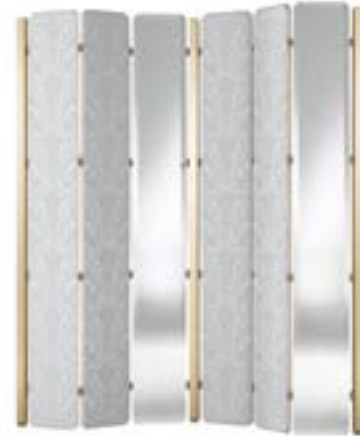
MAL-23B MADELEINE Screen with structure in multilayer wood panel and bevelled mirrors. Upholstery in fabric MIL 19.05. Brass frame. 212 x h 250 cm