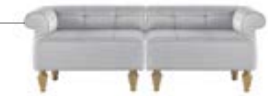
MUS-07BDX / MUS-07BSX MUSA

Right and left benches with structure in beech solid wood and foam. Upholstery in fabric MIL 19.06. Feet finished in antique gold with patina J2880. 100 x 70 x h 60 cm (each)