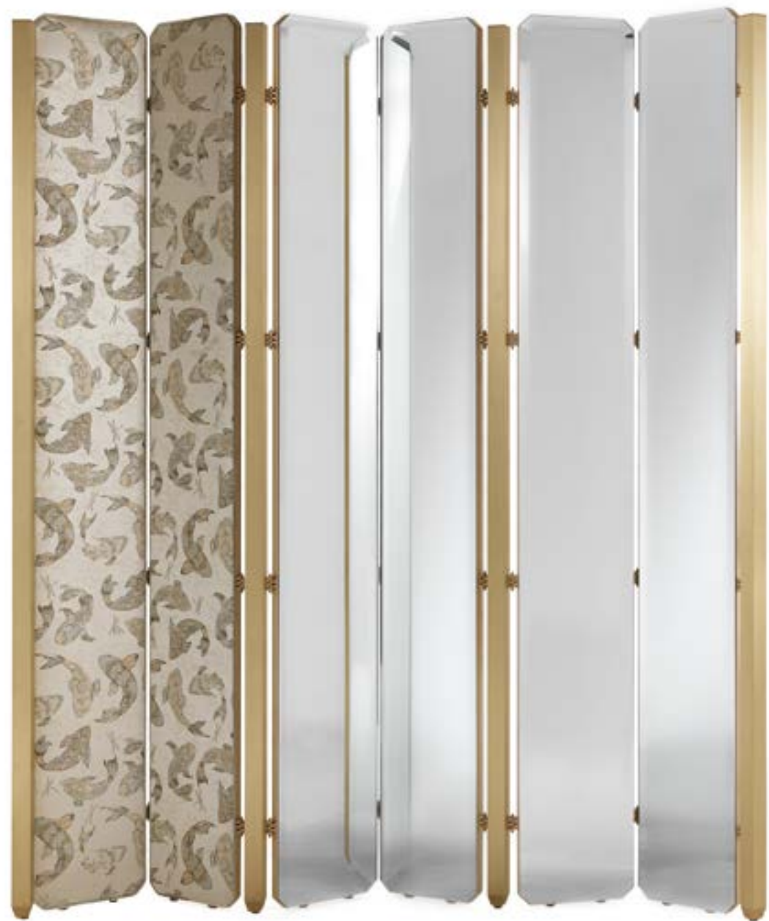
MADELEINE SCREEN WITH MIRRORS