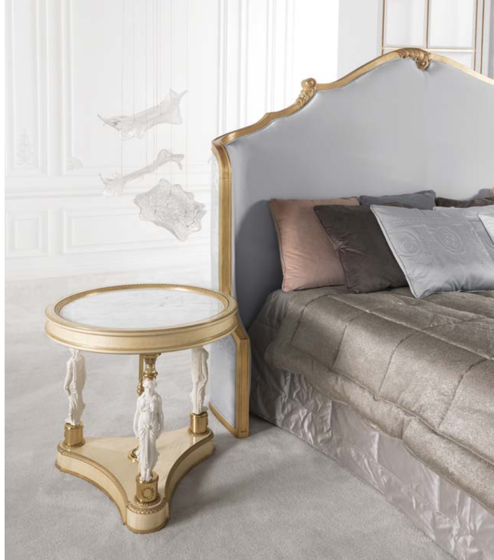
ANECY BED IN CARVED WOOD WITH UPHOLSTERED HEADBOARD TOULOUSE SIDE TABLE

Anecy bed: a scenographic piece of furniture, designed to be the protagonist of the night area and characterized by an antique gold frame and a precious and refined light-grey satin upholstery.