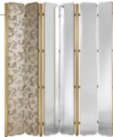
MAL-23 MADELEINE Screen with structure in multilayer wood panel and bevelled mirrors. Upholstery in fabric MIL 18.14. Brass frame. 212 x h 250 cm