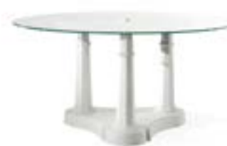
REL-14R RELIEF Entrance table with structure in white marble. Top in extralight bevelled glass. ø 160 x h 78 cm