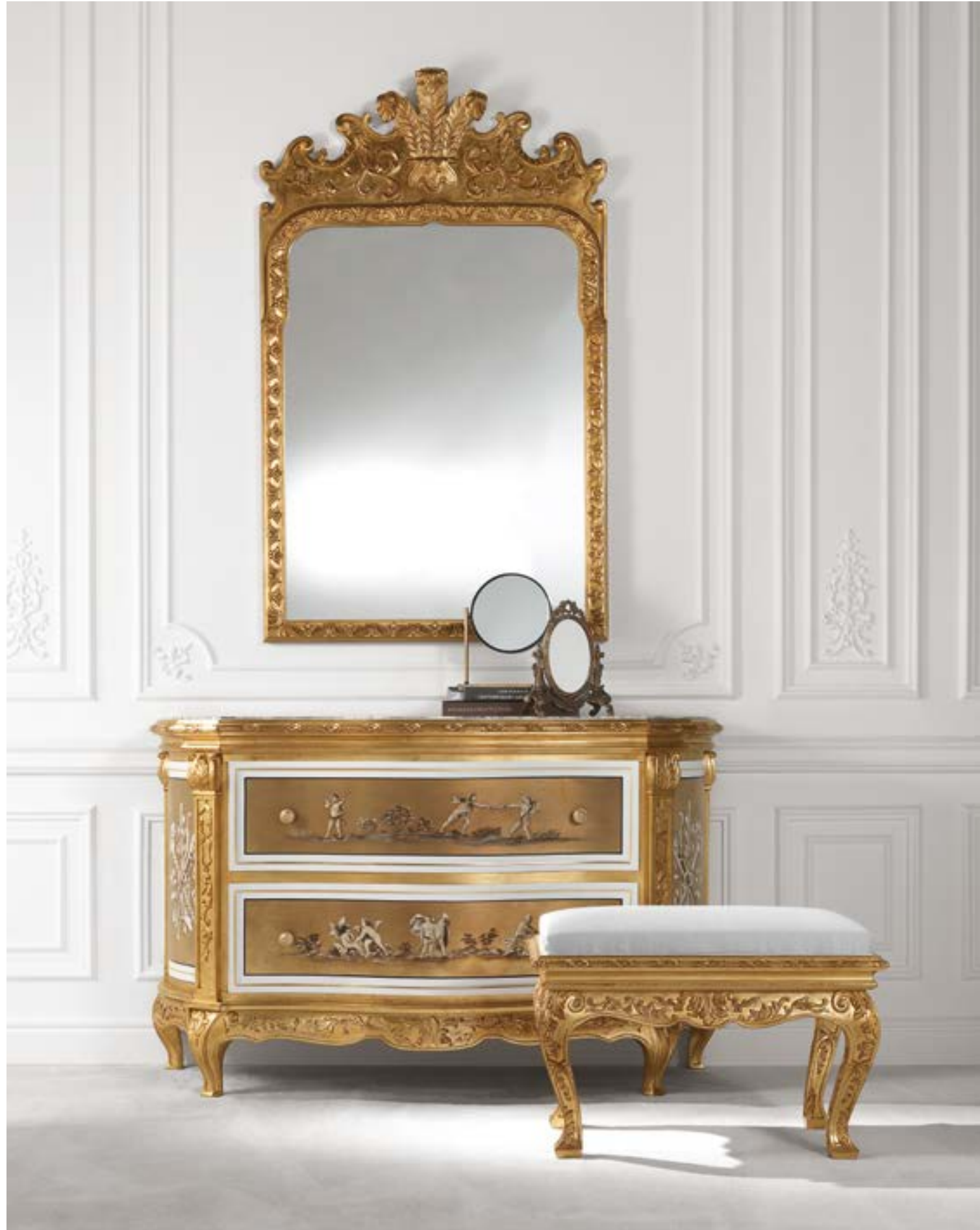
FRAGONARD MIRROR CHEST OF DRAWERS POUF

A light and delicate baroque style chest of drawers with low relief carvings and antiqued gold leaf decorations. It features renaissance decorations with cupids, represented in classical art's humanism as realistic children.