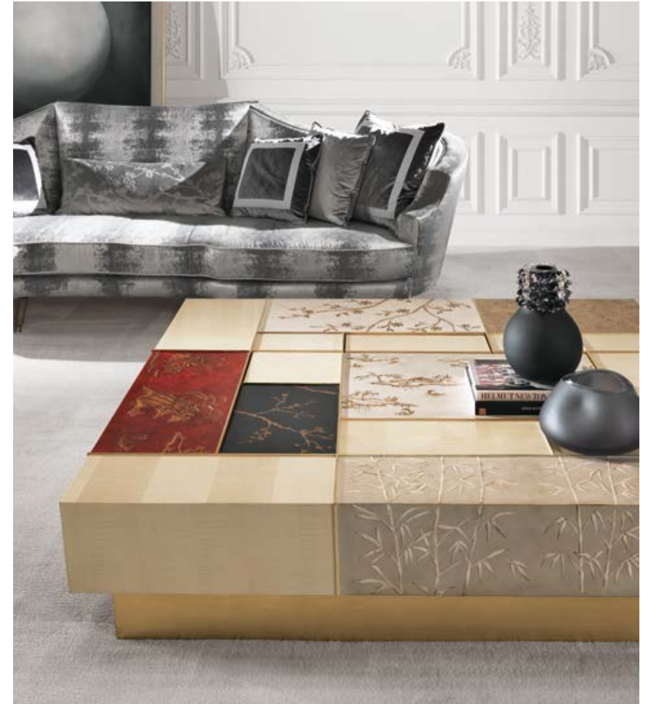
UKIYO CENTRAL TABLE SHOGUN SOFA