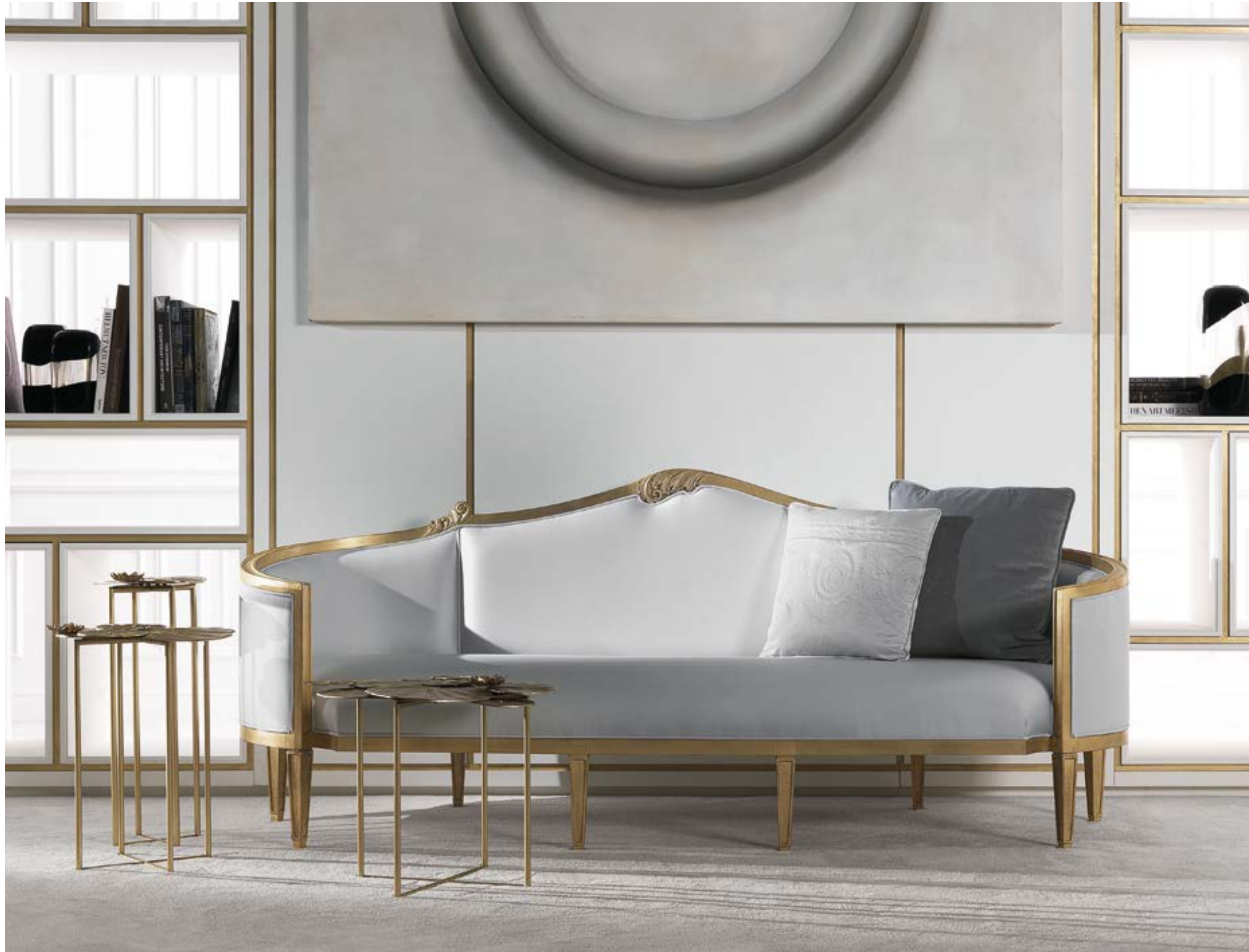
ANNECY LOVE SEAT MONET SIDE TABLES