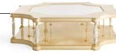
TOU-46 / TOU-146 TOULOUSE

Central table with structure in multilayer maple wood. Top with white marble insert. Profile and details in antique gold with patina JG294. Bisquit porcelain statues. Also available with neoclassical columns (TOU-146). Lost-wax casted brass details. 210 x 210 x h 56 cm