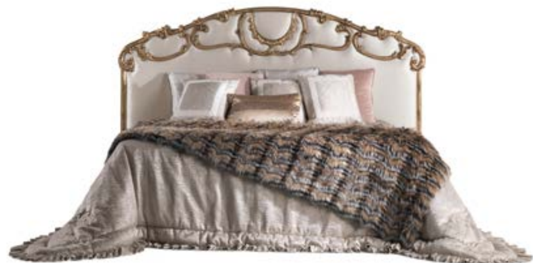
MADELEINE BED IN BRASS WITH UPHOLSTERED HEADBOARD

The Madeleine line elegantly expresses the encounter between classic styles and clean, contemporary lines. The sophistication and sensuality of the furniture line is expressed in a luminous combination of delicate shades. The headboard of the bed is upholstered in silver plate while the decorative elements are in brass casting, recounting the craftsmanship and attention to detail that is typical of the brand.