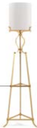
CHA-SEL SELENIA Floor lamp in brass with gold finishing. Satin shade. 36 x h 187 cm