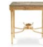
SHO-47 SHOGUN Console with structure in lost-wax casted brass. Wooden legs with glossy gold finishing. Top in Cloudy onyx. 78 x 48 x h 90 cm