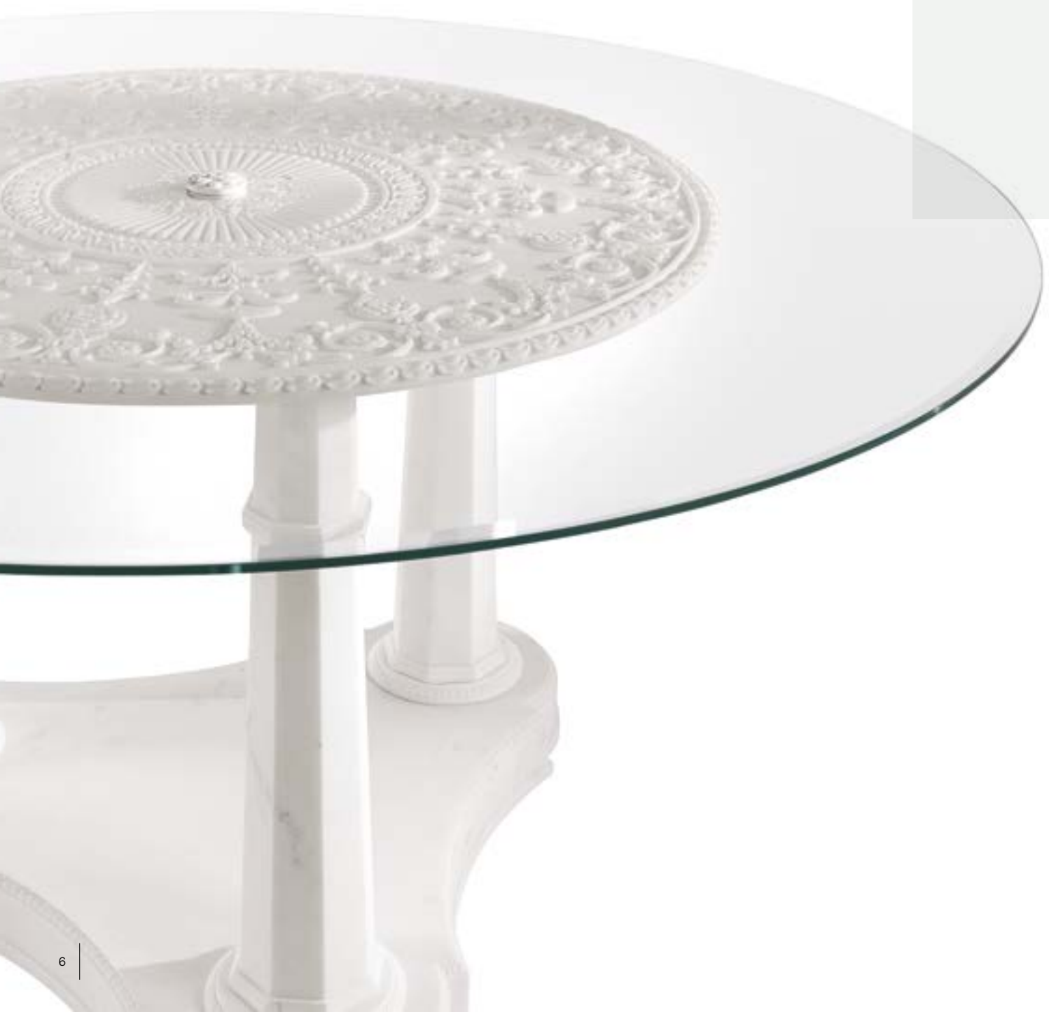
RELIEF ENTRANCE TABLE