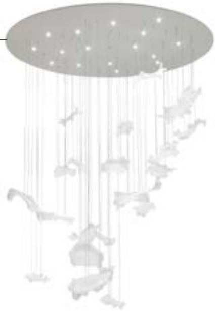
CHA-FEU-80 / 140 / 200 FEUILLE Chandelier with suspended decorative elements made in Murano glass with craquelet effect. Upper round plate with spot lights. ø 200 cm Also available: ø 140 cm and ø 80 cm