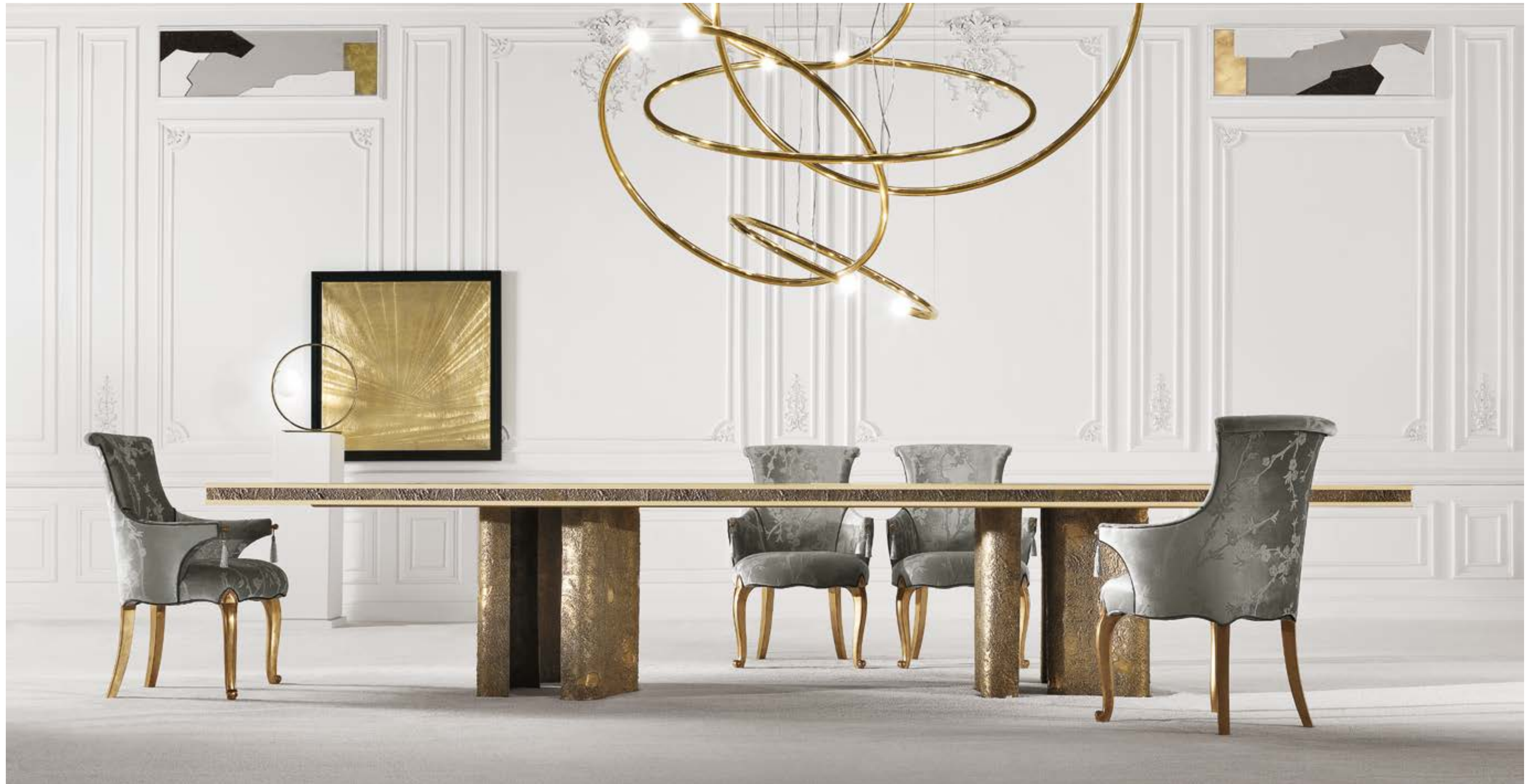
SHINTO DINING TABLE RIVOLI CHAIRS OSAKA CEILING LAMP SPIRTOS TABLE LAMP GOLDRAY PAINTING