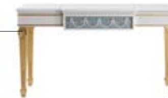
POR-21 PORTLAND Console with structure in beech solid wood. Decorative figures in style of Wedgwood ceramic. White and grey laquered finishing with bisquit porcelain effect with mat and shiny gold leaf JG293. 158 x 47 x h 91 cm