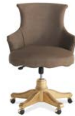
RIVOLI SWIVEL ARMCHAIR