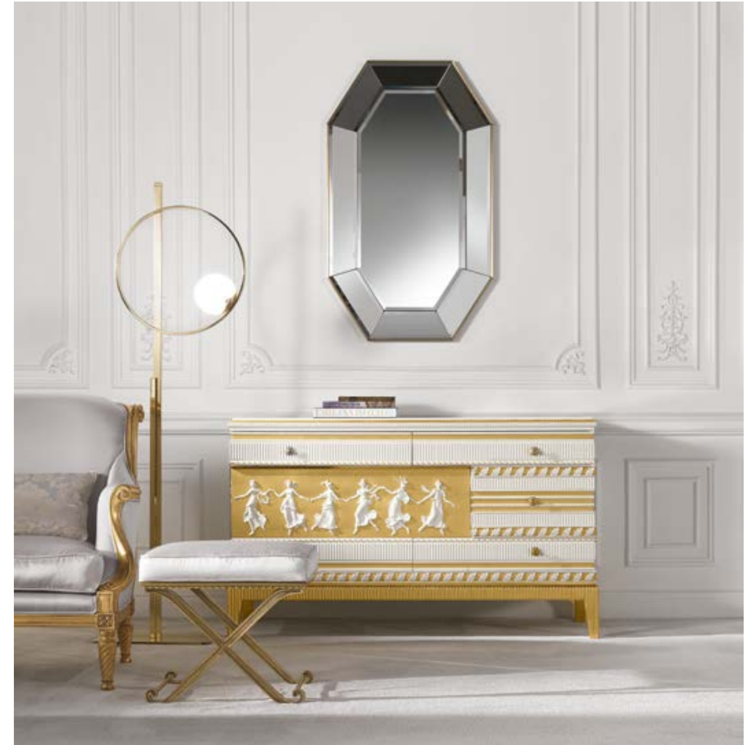
OCTOGONE MIRROR PORTLAND CHEST OF DRAWERS PLEASURE STOOL SPIRTOS FLOOR LAMP