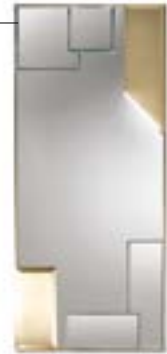
DEC-12 DECÒ Mirror with structure in brass and bevelled mirrors. Lighting system. 82 x 3 x h 190 cm