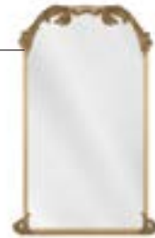
MAL-104B MADELEINE Mirror with structure in casted brass. Natural mirror. 85 x h 130 cm