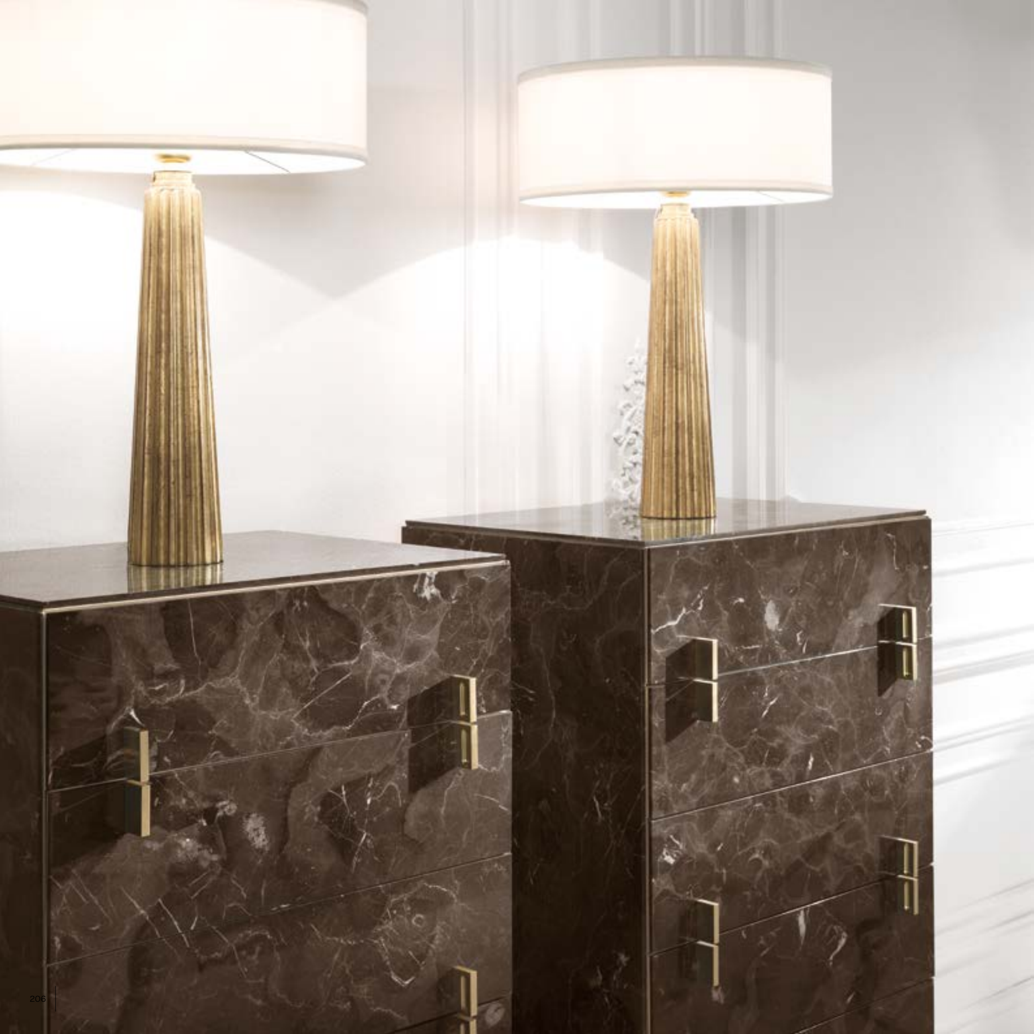
SHINTO CHEST OF DRAWERS AISA TABLE LAMPS