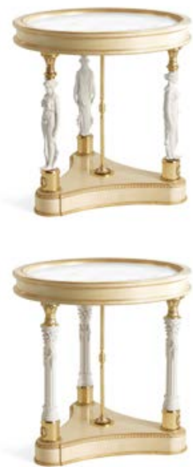
TOULOUSE SIDE TABLES

An elegant line that perfectly expresses the spirit of the 2019 collection, through a wise combination of quality materials and high level of craftsmanship. The main feature is the presence of caryatids or classical columns, made of porcelain with biscuit finish, lending the sculptures a matte appearance and texture to the touch.