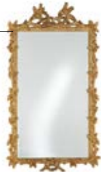
CHAB-12 CHABLIS Mirror with structure in hand-carved beech wood finished in gold with patina J2910. Bevelled mirror. 107 x h 185 cm