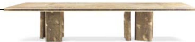
SHI-14-2B SHINTO Dining table with sculptural bases in lost-wax casted brass, antique bronze finishing. Top in maple wood and Cloudy onyx with brass profiles. 400 x 140 x h 79 cm