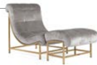
MAR-51 / MAR-58 MARQUISE

Armchair and foot-rest with structure in bronzed brass and foam. Upholstery in fabric MIL 18.09. 67,5 x 102 x h 87 cm 67,5 x 50 x h 45 cm