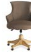
RIV-35 RIVOLI Swivel armchair with structure in poplar solid wood and foam. Upholstery in Brown Nabuk. Base in antique gold with patina J2880. 73 x 80 x h 109 cm