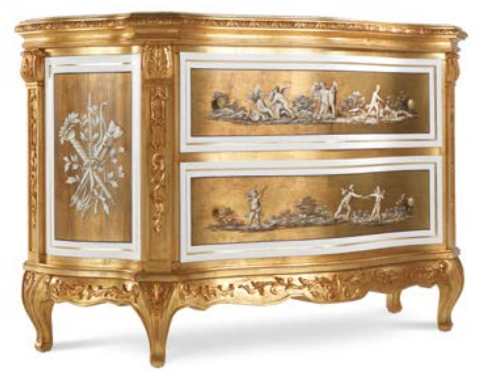
FRAGONARD CHEST OF DRAWERS