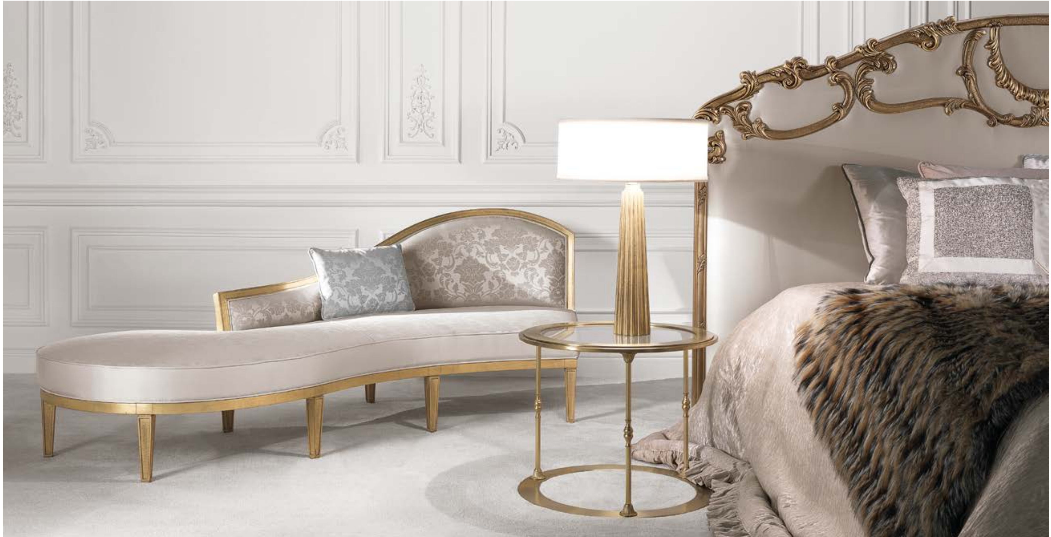
MADELEINE BED IN BRASS WITH UPHOLSTERED HEADBOARD